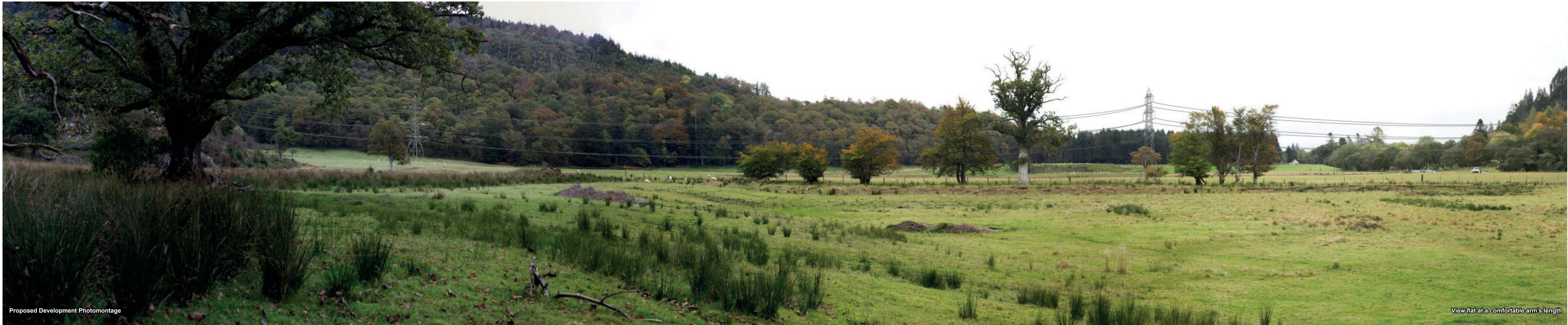
Proposed Development Photomontage