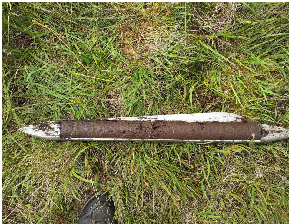
Photograph D1: Peat Core C01, NGR 217300, 687676