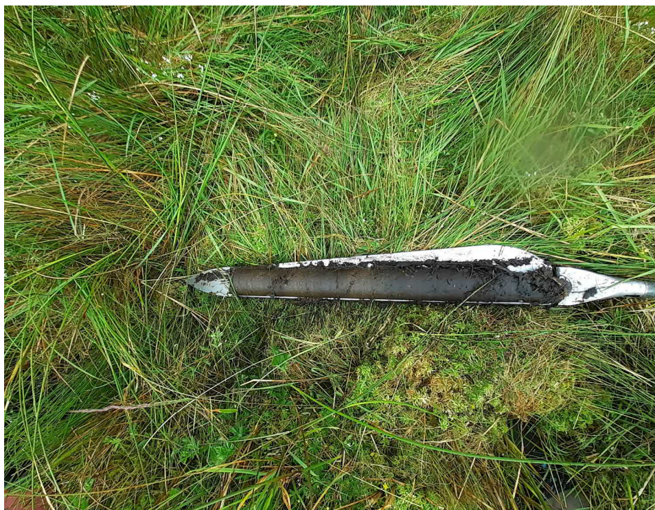
Photograph D4: Peat Core C04, NGR 215743, 685251