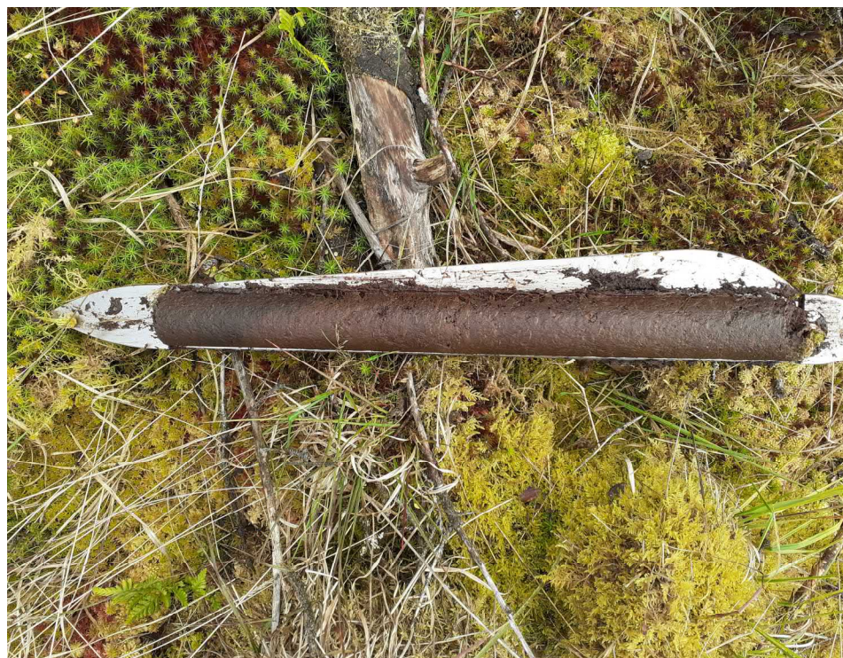
Photograph D5: Peat Core C05, NGR 214676, 680290