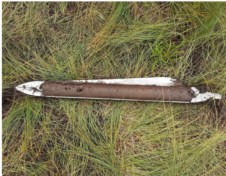
Photograph D2: Peat Core C02, NGR 216361, 686437