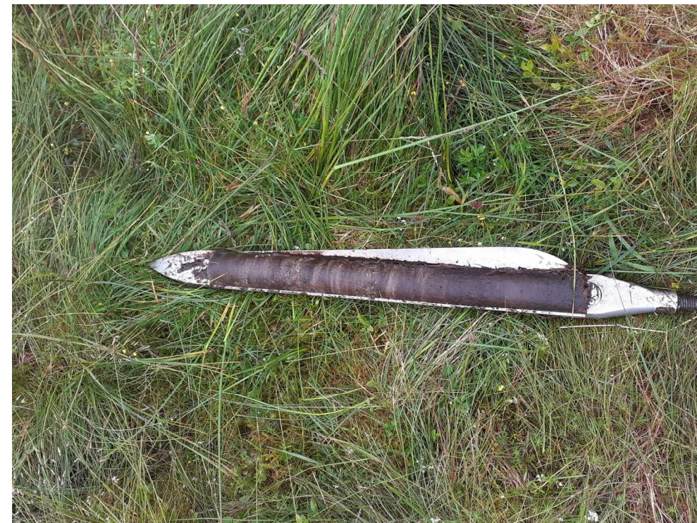
Photograph D3: Peat Core C03, NGR 215880, 685766