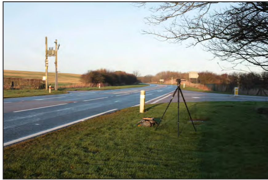
View 1 Camera location