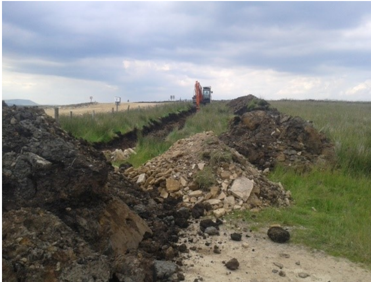
Plate 3.2: Stockpile and drainage ditch (under construction)

In accordance with BS 3882 'Specification for Topsoil and Requirements for Use' 21 , any long-term stockpiling of topsoil should not exceed 3.0 m in height with a maximum side slope of 1 in 2. In its dry non plastic state, topsoil can be stockpiled in a 'loose tipped' manner and tracked in a compacting method reducing water ingress. Wetter soils can be stored in windrows for drying and later stockpiled for re-use. The re-wetting of peat will be carried out if there is a potential risk of the peat drying out. Mineral and peat soil stockpiles will not be allowed to dry out.