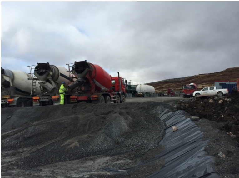
Plate 3.12: Concrete Wash-out Facility

In the event that plant and wheel washing is required, dry wheel wash facilities and road sweepers will be provided to prevent (as far as is practicable) mud and debris being carried from within the site onto the public road.