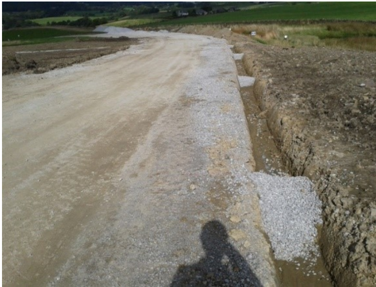
Plate 3.6: Check dam example