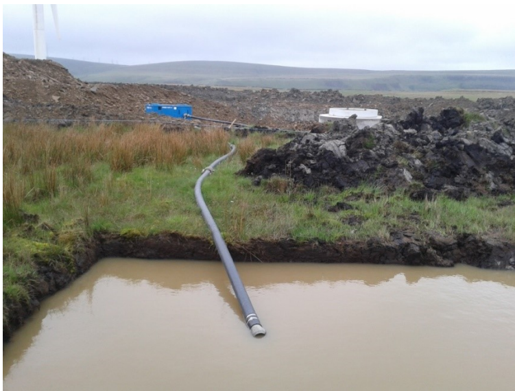
Plate 3.8: Settlement Lagoon and Siltbuster Pumping Water for Treatment

Any pumping activities will be supervised and authorised by the Principal Contractor's Project Manager.