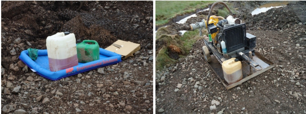
Plate 3.10 and Plate 3.11: Drip Trays and Bunds to Prevent Chemical Spillages