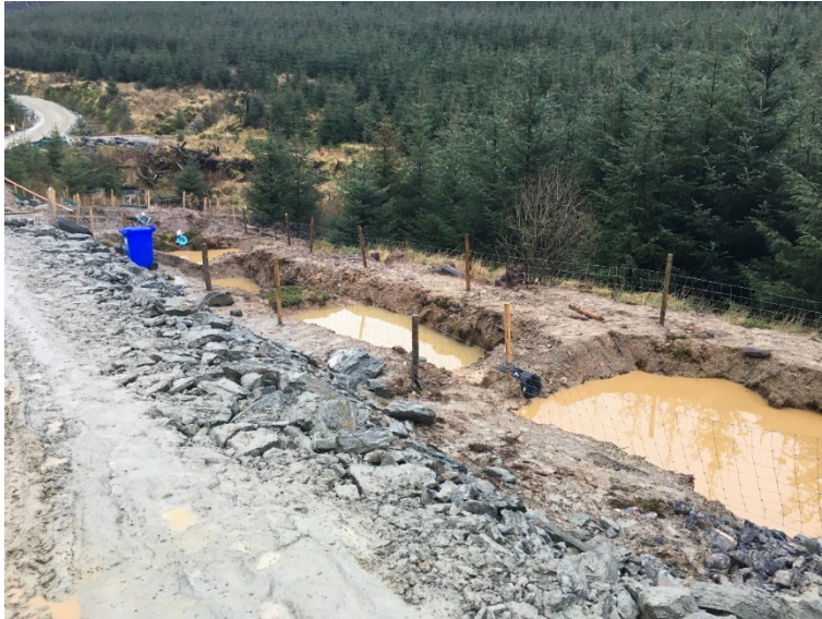
Plate 3.7: Settlement Lagoon Series