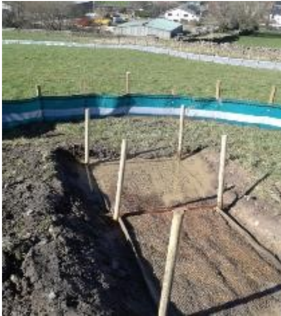
Plate 3.3: Silt matting (combined with silt fencing)