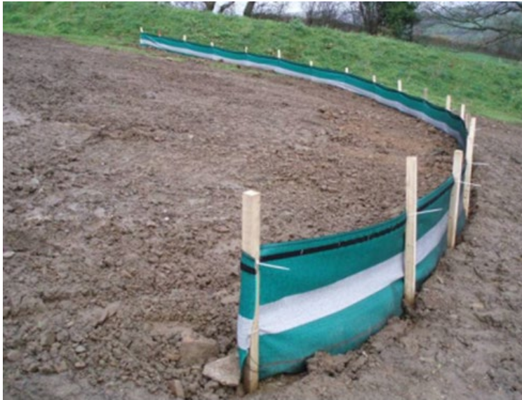
Plate 3.5: Silt Fencing at Watercourse Crossing