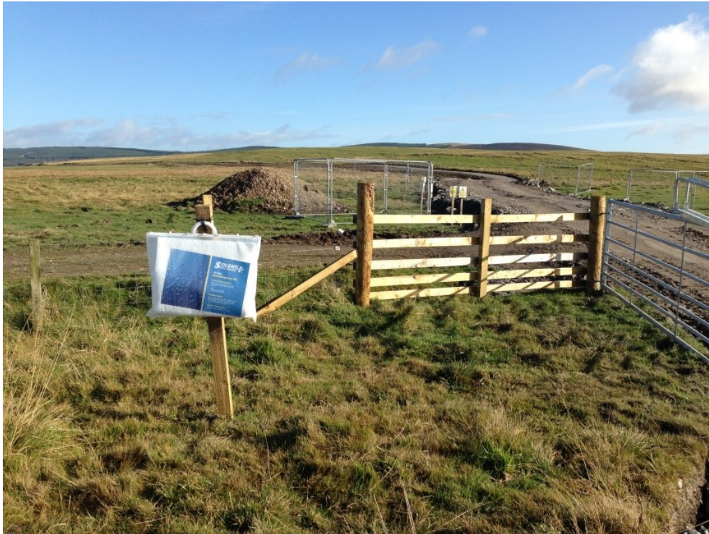
Plate 3.9: Spill Kit Provision on Site

Speed limits for vehicles transporting concrete will be set at a maximum of 15 miles per hour (mph) and will be monitored. Maximum vehicle load capacities will not be exceeded. Although tracks will be maintained in good condition, vehicle loads will be reduced when a rougher surface is identified prior to track maintenance.