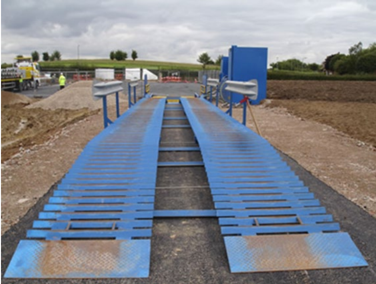
Plate 3.13: Vehicle wheel wash facility

Should debris be spread onto the site access or public road adjacent to the Project, then road sweepers will be quickly utilised to clean affected areas. Loose debris will also be periodically removed from on-site tracks. All heavy goods vehicles (HGVs) taking construction materials to and from the site will be sheeted to prevent the spillage or deposit of material on the highway.