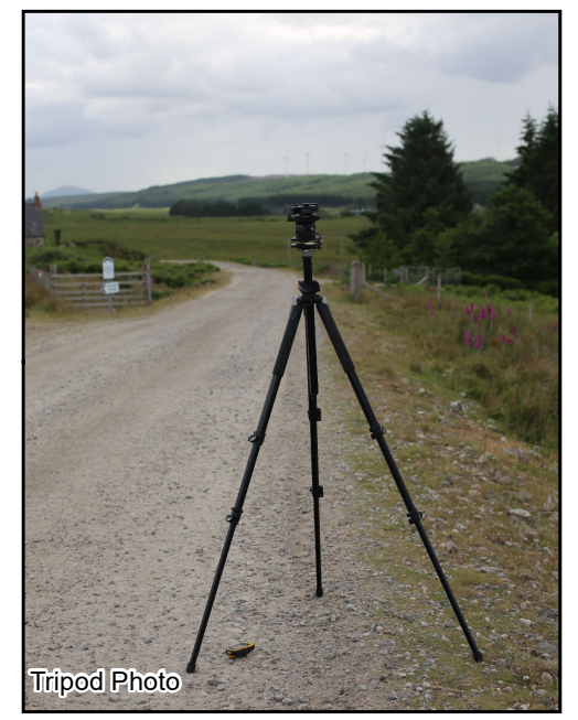
Grid Ref: 283071, 961060