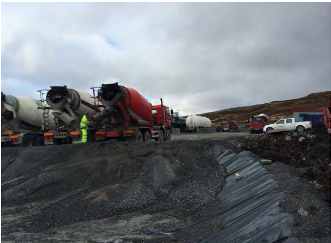
Plate 3.11: Concrete Wash-out Facility

In the event that plant and wheel washing is required, dry wheel wash facilities and road sweepers will be provided to prevent (as far as is practicable) mud and debris being carried from within the site onto the public road.