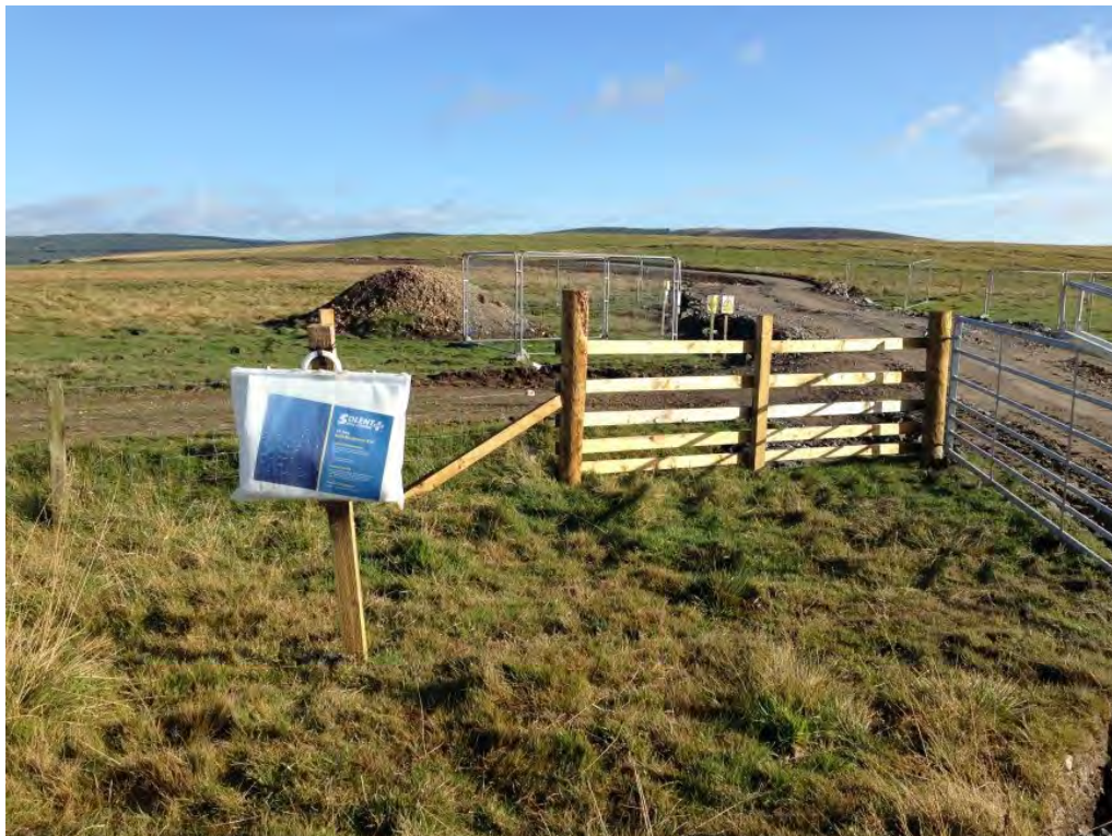
Plate 3.8: Spill Kit Provision on Site

Speed limits for vehicles transporting concrete will be set at a maximum of 15 miles per hour (mph) and will be monitored. Maximum vehicle load capacities will not be exceeded. Although tracks will be maintained in good condition, vehicle loads will be reduced when a rougher surface is identified prior to track maintenance.