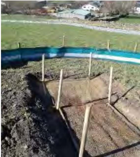
Plate 3.2: Silt matting (combined with silt fencing)