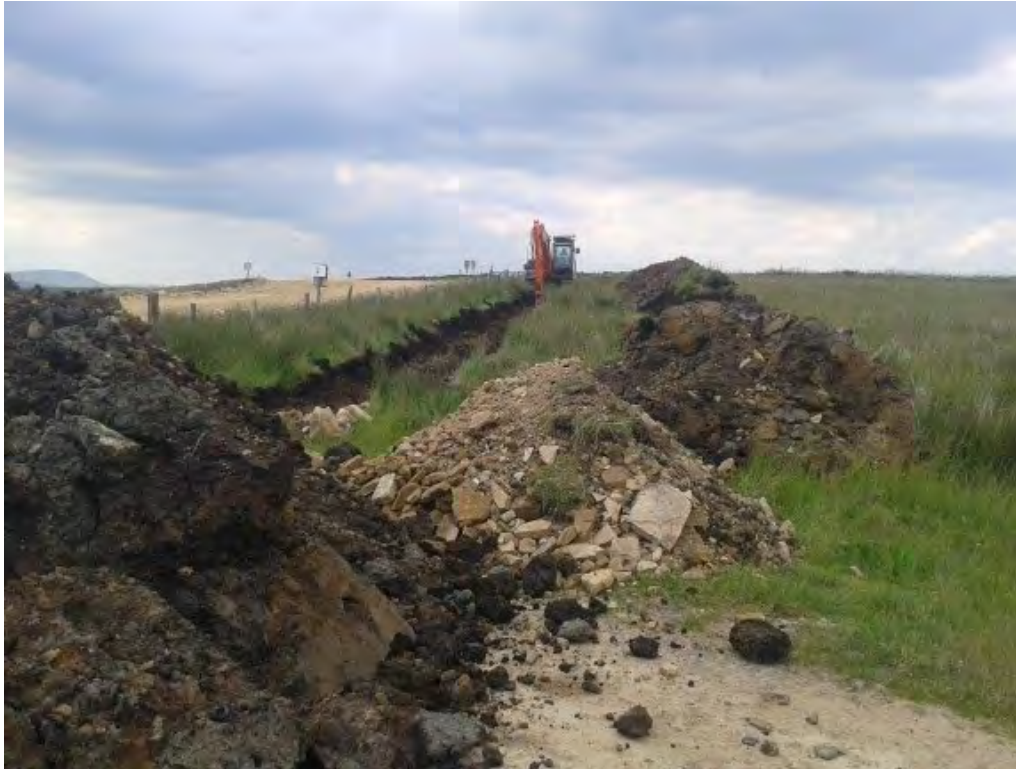
Plate 3.1: Stockpile and drainage ditch (under construction)

In accordance with BS 3882 'Specification for Topsoil and Requirements for Use' 21 , any long-term stockpiling of topsoil should not exceed 3.0 m in height with a maximum side slope of 1 in 2. In its dry non plastic state, topsoil can be stockpiled in a 'loose tipped' manner and tracked in a compacting method reducing water ingress. Wetter soils can be stored in windrows for drying and later stockpiled for re-use. The re-wetting of peat will be carried out if there is a potential risk of the peat drying out. Mineral and peat soil stockpiles will not be allowed to dry out.