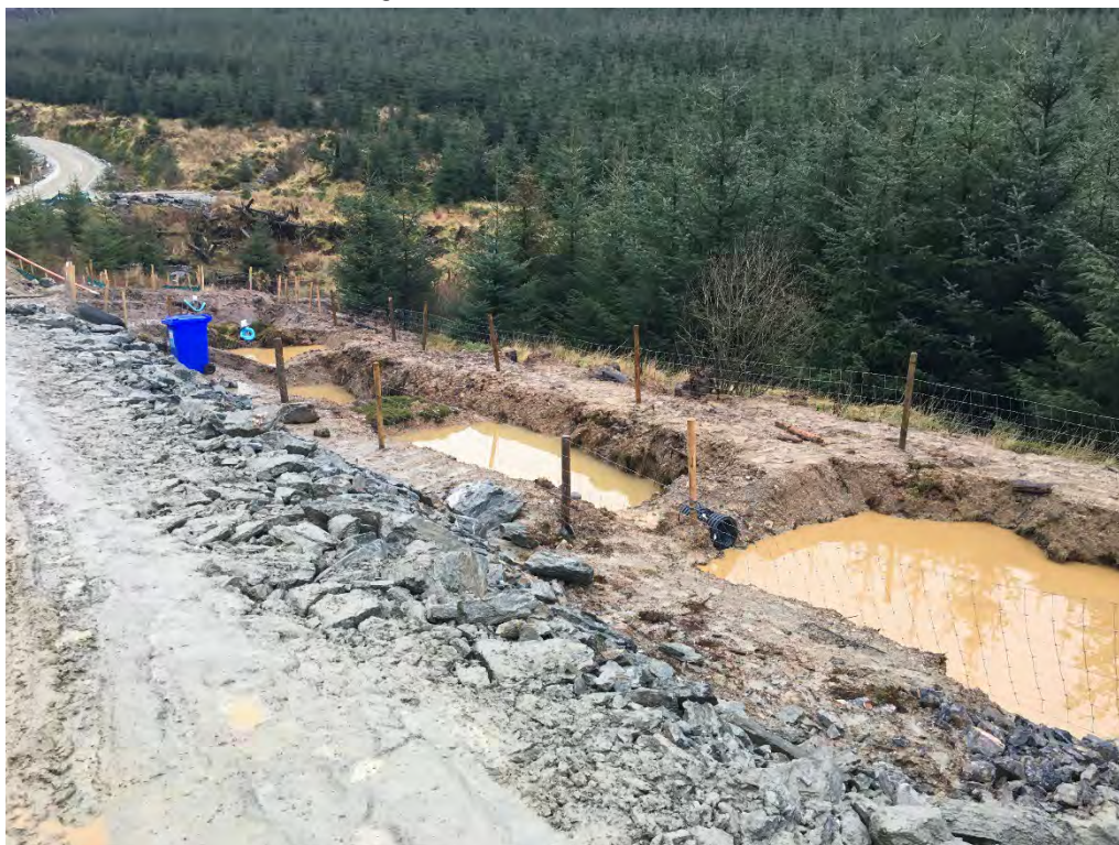
Plate 3.6: Settlement Lagoon Series