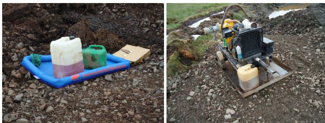
Plate 3.9 and Plate 3.10: Drip Trays and Bunds to Prevent Chemical Spillages

Plate 3.9 and Plate 3.10: Drip Trays and Bunds to Prevent Chemical Spillages show examples of drip trays and bunds.