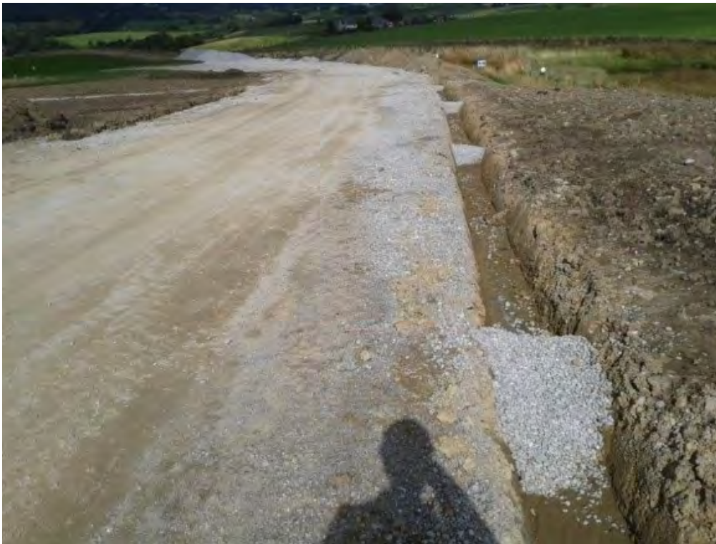
Plate 3.5: Check dam example

Check dams will be installed within drainage ditches at regular intervals, where appropriate. Appropriately sized stone pitching will be used within the dam in order to provide a rough surface for water within the drainage ditch to pass over.