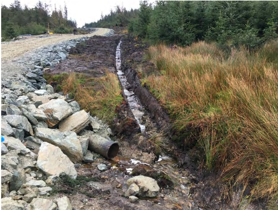
Plate 3:2: Trackside drainage ditch and cross-drainage culvert

Permanent check dams can also be installed to slow the flow of water in ditches with steeper gradients and straightened channels to prevent erosion of channels. Water within channels should be allowed to flow and should not be stagnant, and tracks should be free from standing water through inclusion of camber or cross-fall. Track surface cross-drains can be installed on tracks with long gradients and limited camber, and should be kept free of sediment.