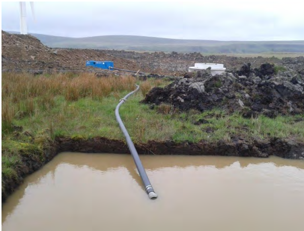
Plate 3.7: Settlement Lagoon and Siltbuster Pumping Water for Treatment

Any pumping activities will be supervised and authorised by the Principal Contractor's Project Manager.