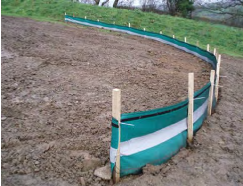
Plate 3.4: Silt Fencing at Watercourse Crossing