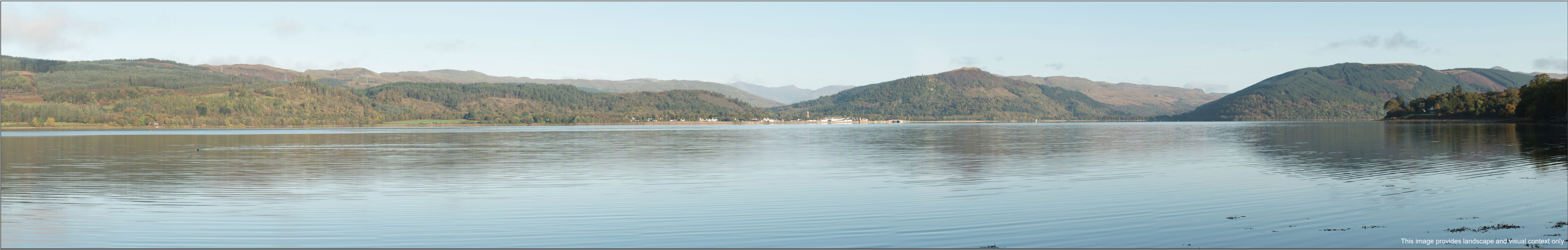
This image provides landscape and visual context only