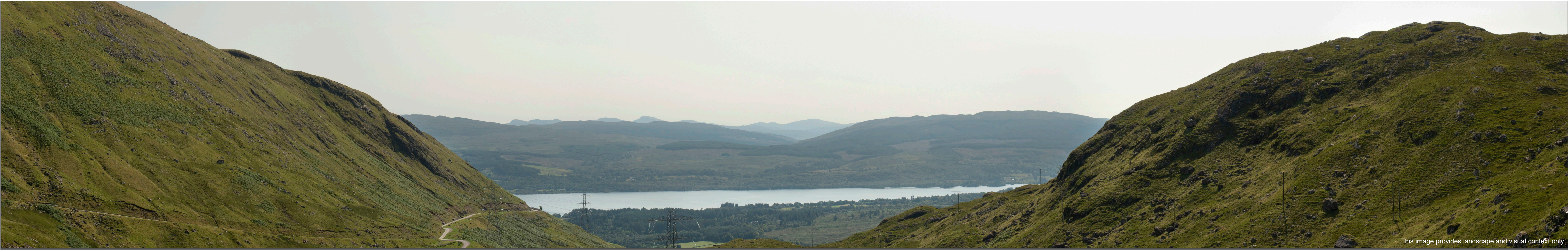
This image provides landscape and visual context only