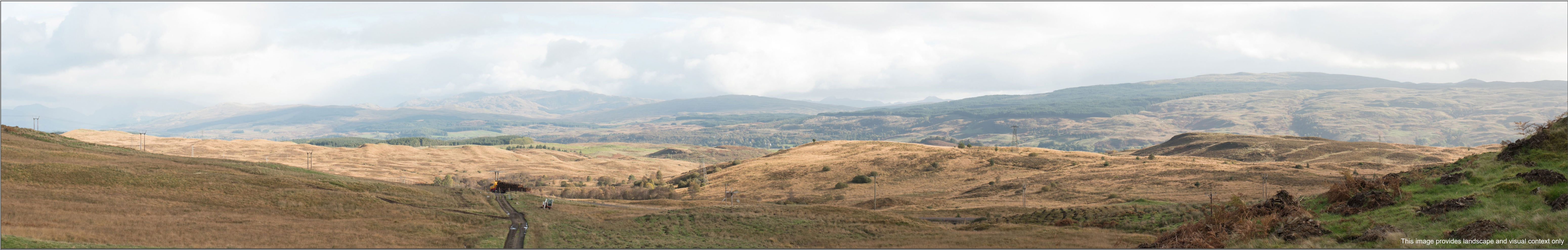
This image provides landscape and visual context only