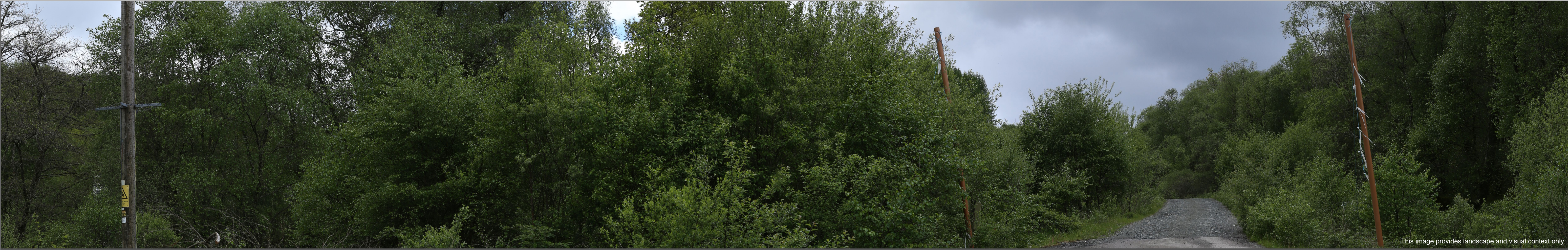
This image provides landscape and visual context only