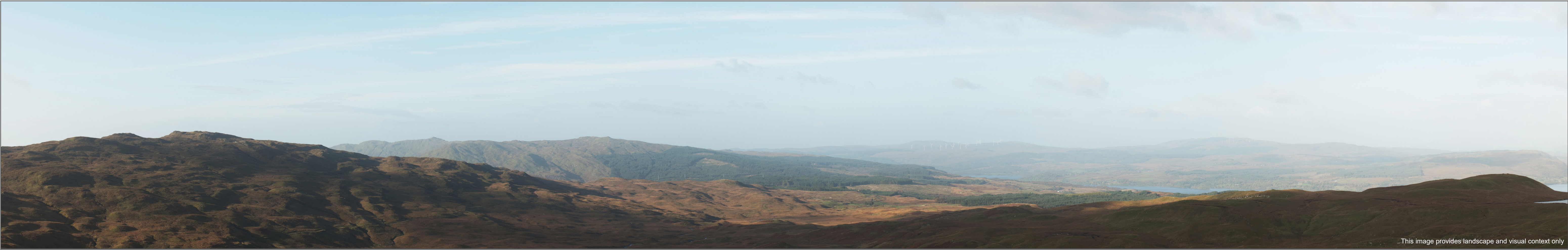
This image provides landscape and visual context only