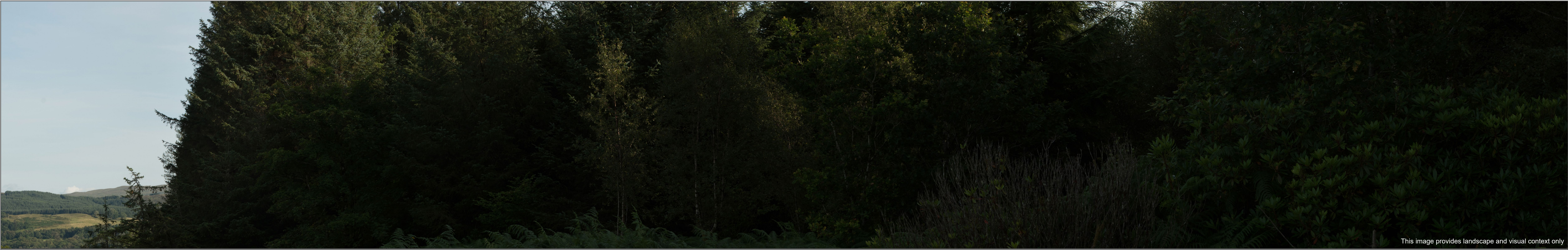
This image provides landscape and visual context only