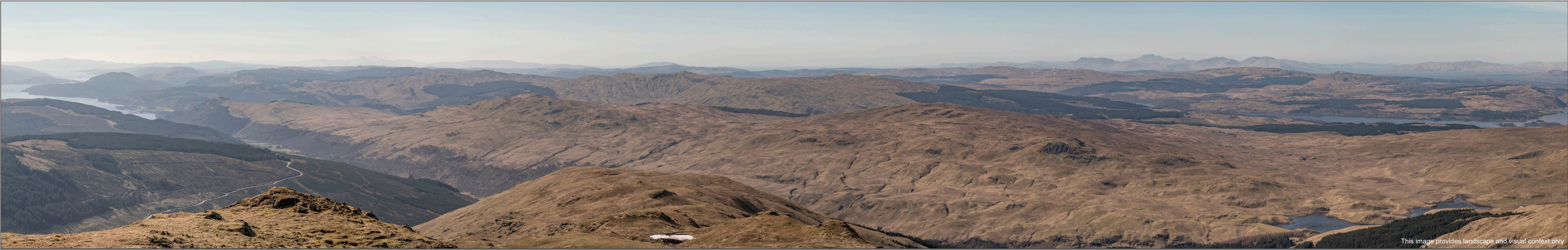
This image provides landscape and visual context only