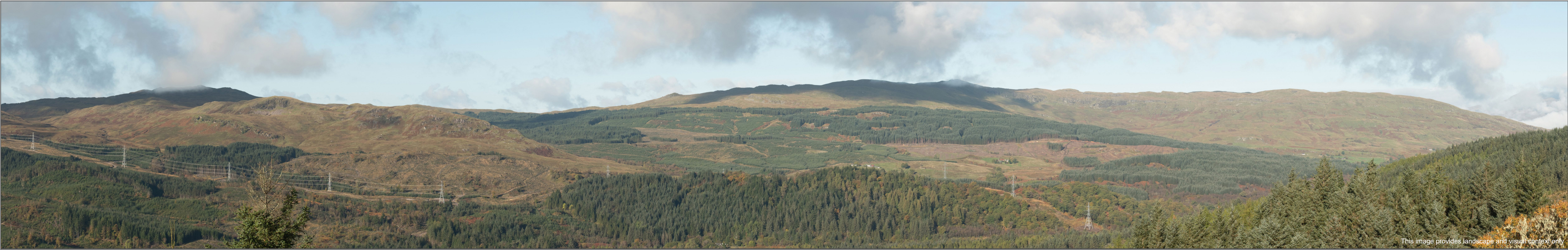
This image provides landscape and visual context only