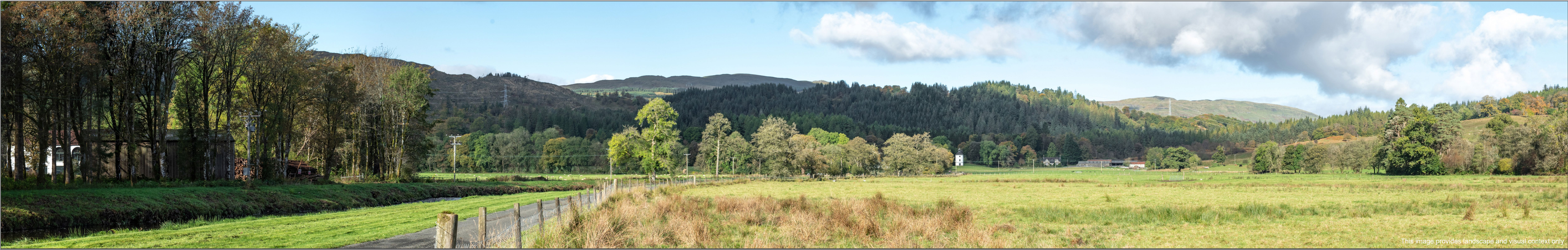
This image provides landscape and visual context only