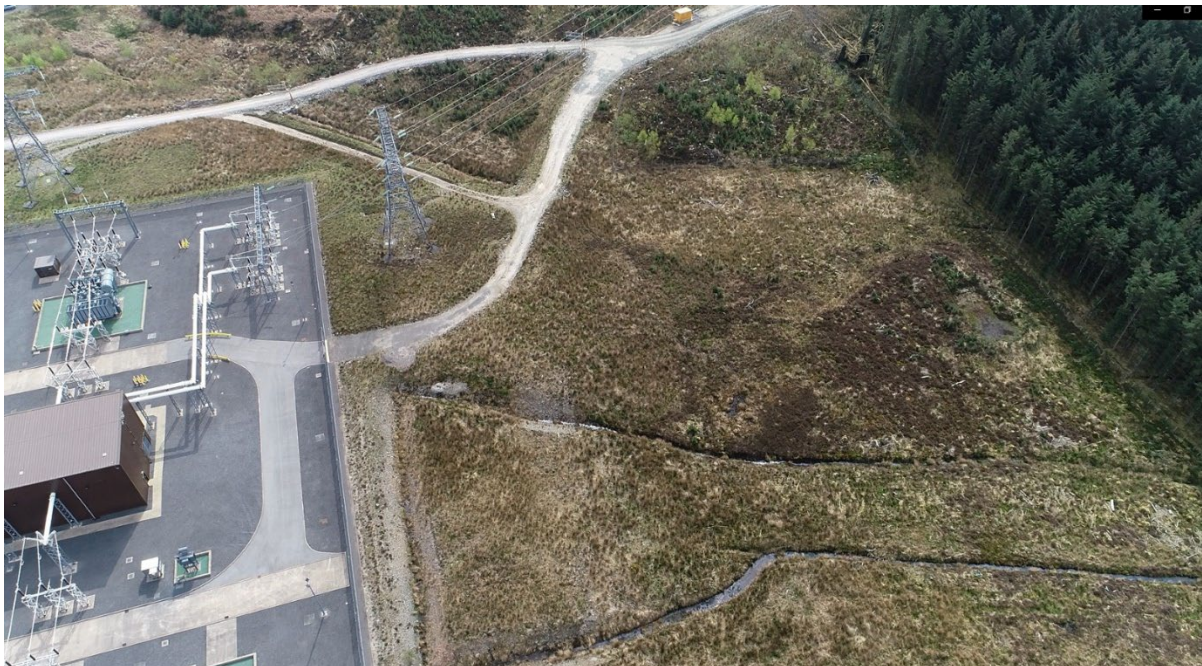
Aerial view 2 – Broadleaf plantation adjacent to forest road

5.5.5. There is a second, similar deer-fenced broadleaf planting site approximately 250m southeast of the Proposed Development (adjacent to the existing forestry/farm track and the B842, see Aerial view 2 below). This planting site also has a level of weed competition and natural regeneration of mixed conifers however it lies on sloped ground with effective drainage, which has helped the mixed broadleaves outcompete small areas of weed growth. The Proposed Development could benefit from managing weed growth in this area and retaining this plantation as a screen.