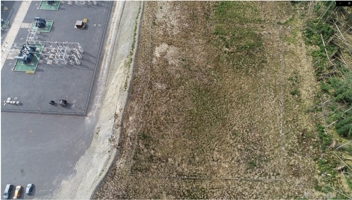
Aerial view 1 – Fenced broadleaf plantation

5.5.5. There is a second, similar deer-fenced broadleaf planting site approximately 250m southeast of the Proposed Development (adjacent to the existing forestry/farm track and the B842, see Aerial view 2 below). This planting site also has a level of weed competition and natural regeneration of mixed conifers however it lies on sloped ground with effective drainage, which has helped the mixed broadleaves outcompete small areas of weed growth. The Proposed Development could benefit from managing weed growth in this area and retaining this plantation as a screen.