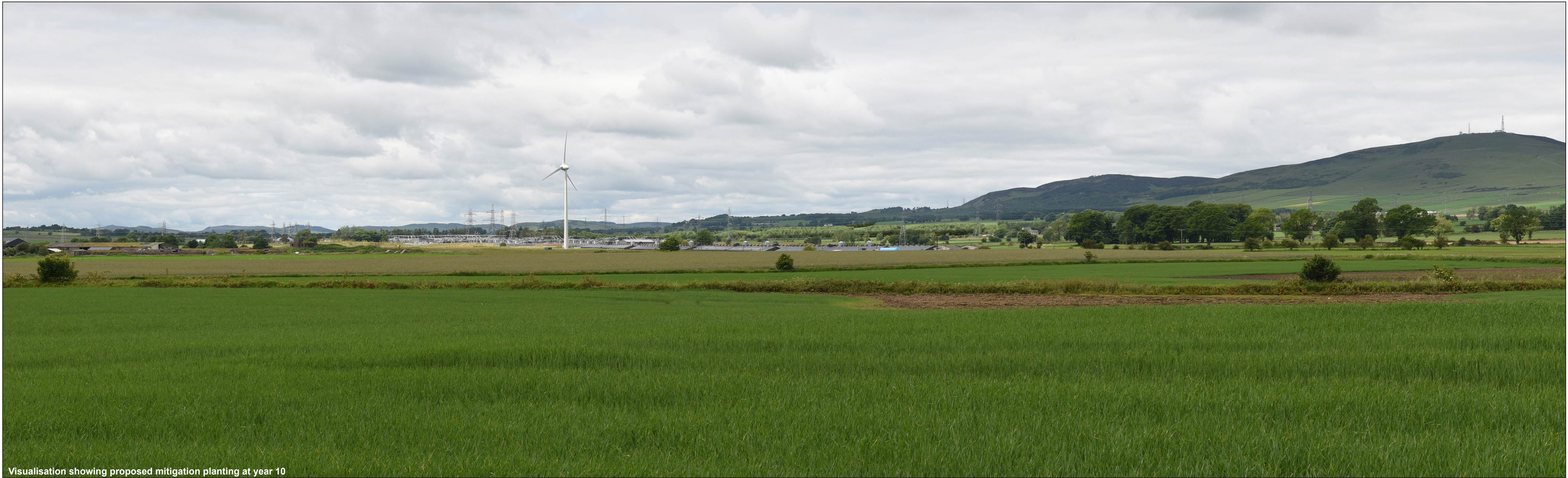
Visualisation showing proposed mitigation planting at year 10