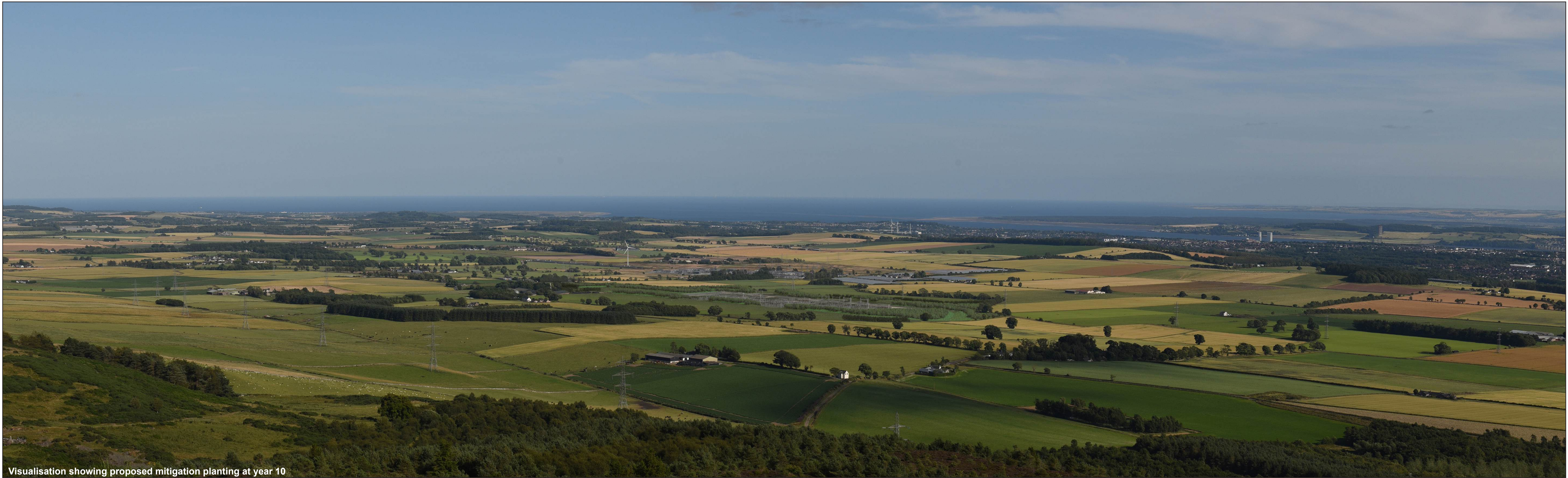
Visualisation showing proposed mitigation planting at year 10