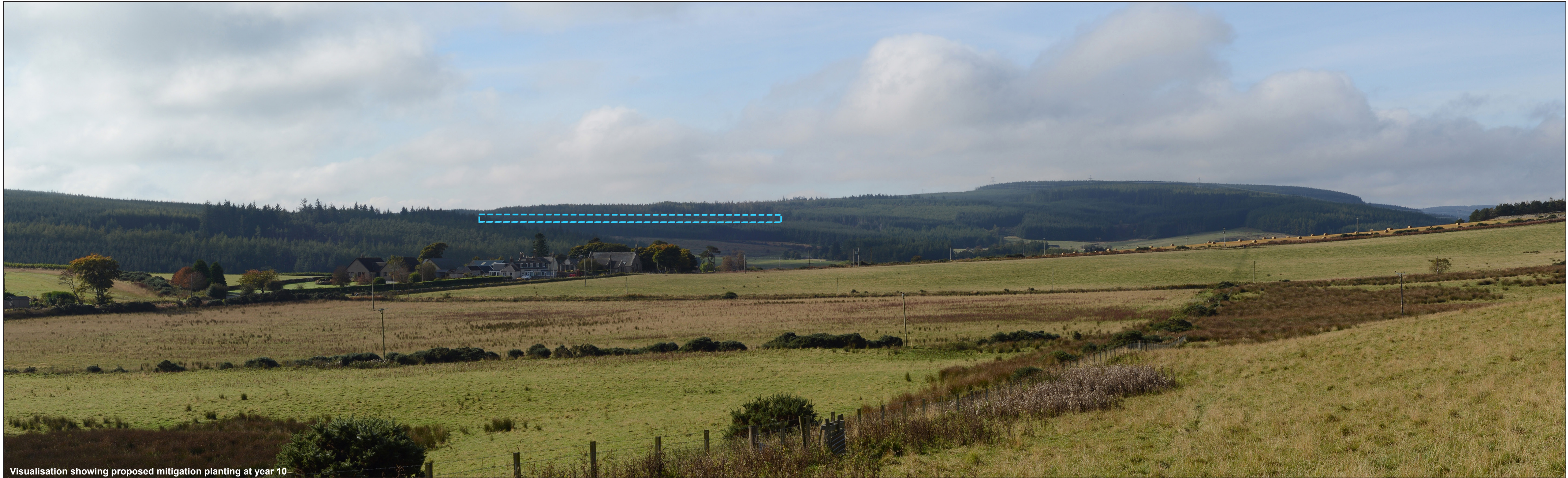
Visualisation showing proposed mitigation planting at year 10