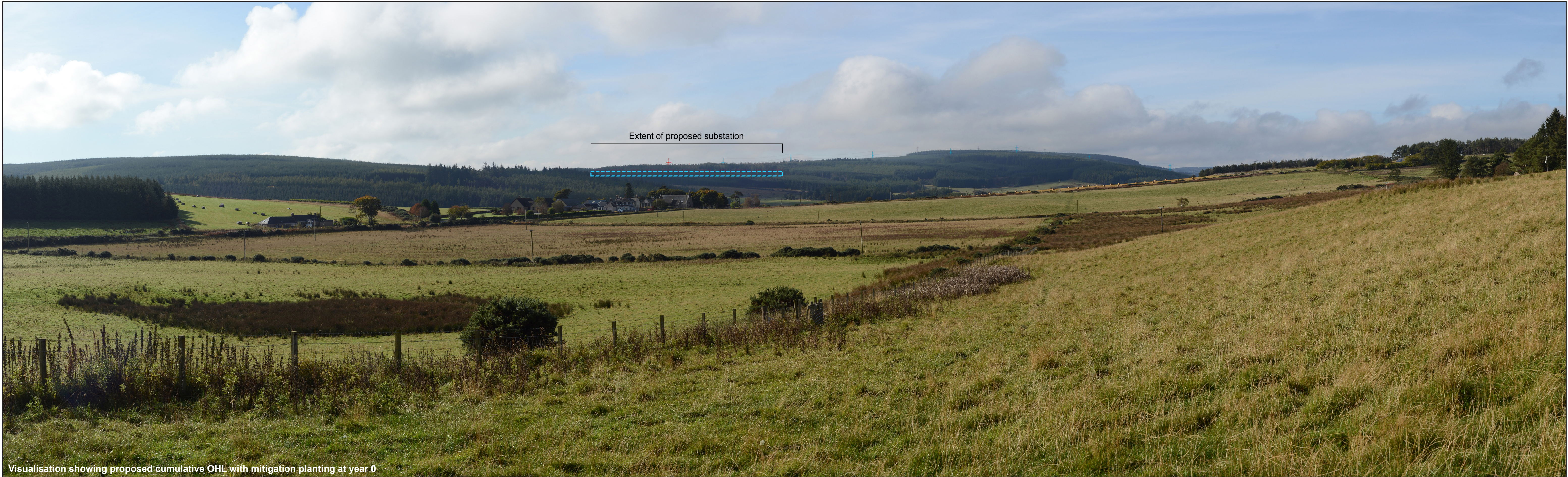
Visualisation showing proposed cumulative OHL with mitigation planting at year 0