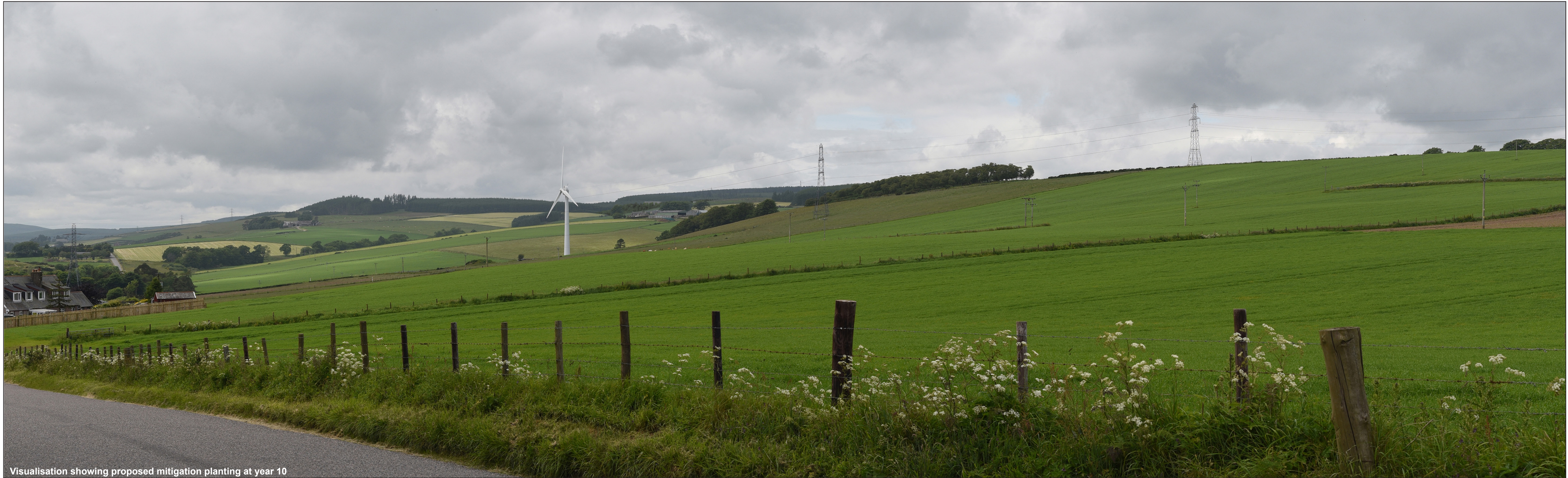
Visualisation showing proposed mitigation planting at year 10