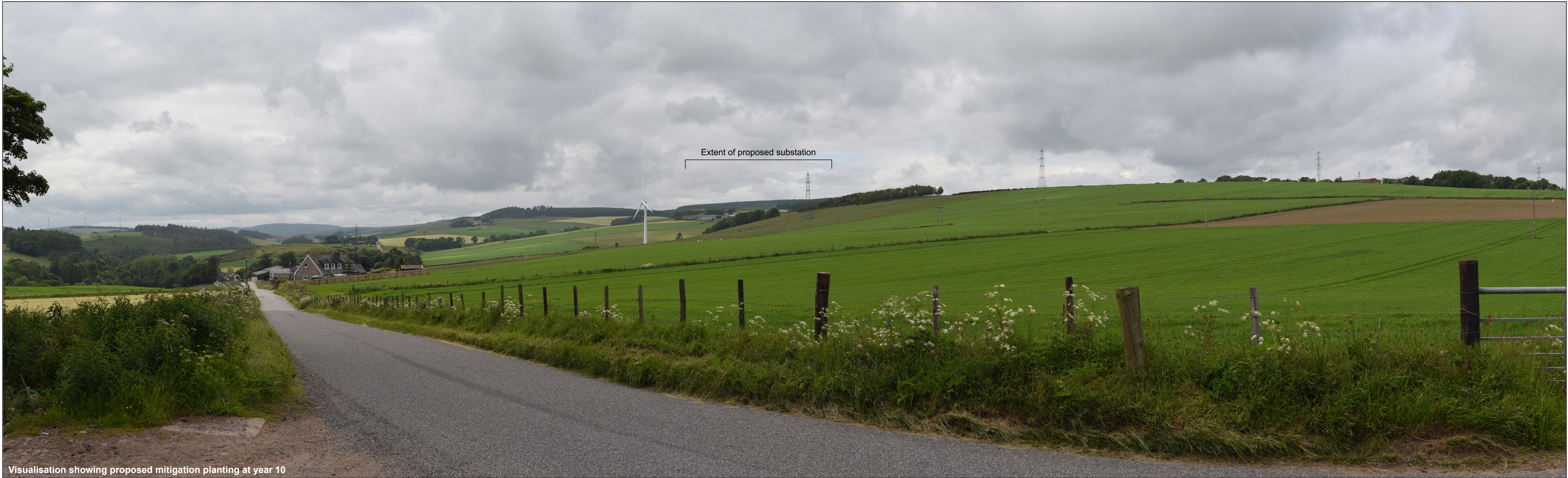
Visualisation showing proposed mitigation planting at year 10