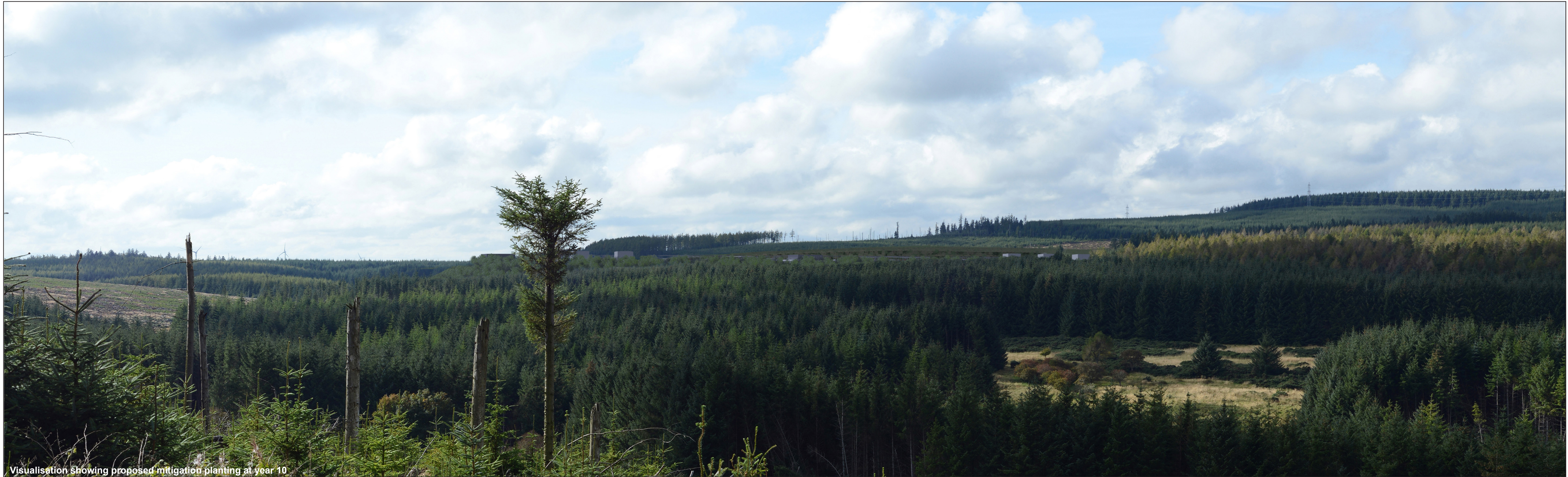
Visualisation showing proposed mitigation planting at year 10