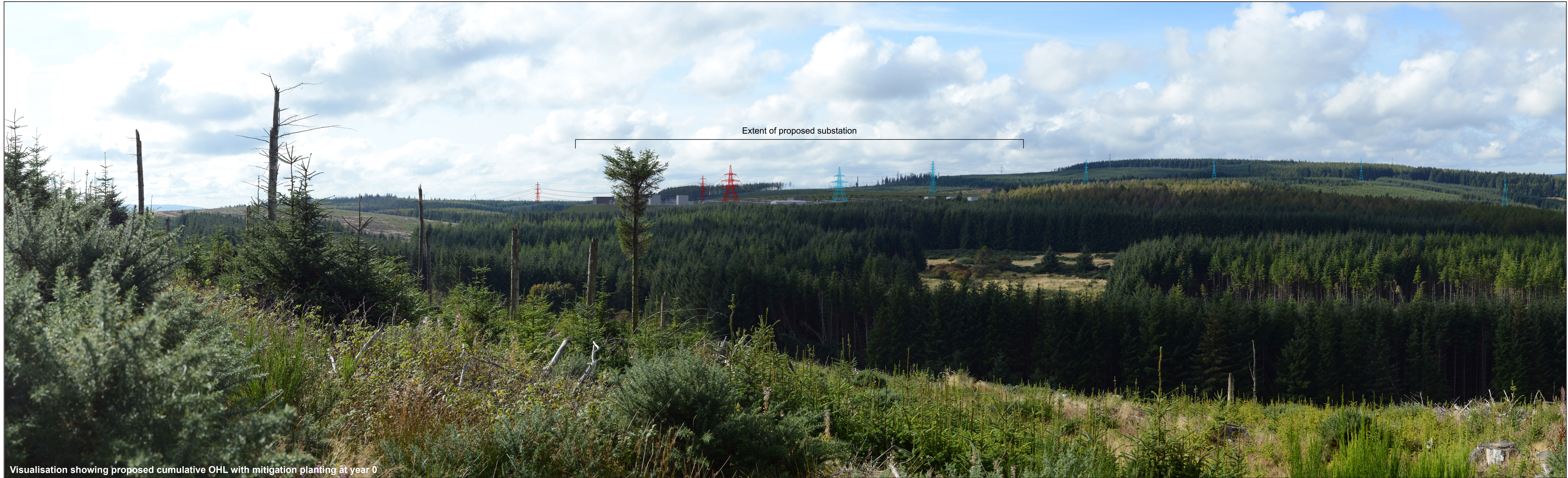
Visualisation showing proposed cumulative OHL with mitigation planting at year 0