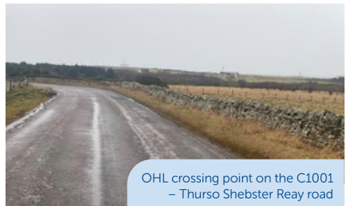
OHL crossing point on the C1001 – Thurso Shebster Reay road