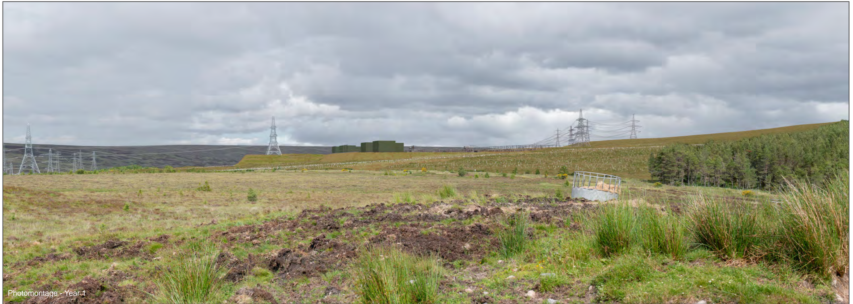
Figure: 5.7b Viewpoint 3 - Cumulative View Carnegie Road