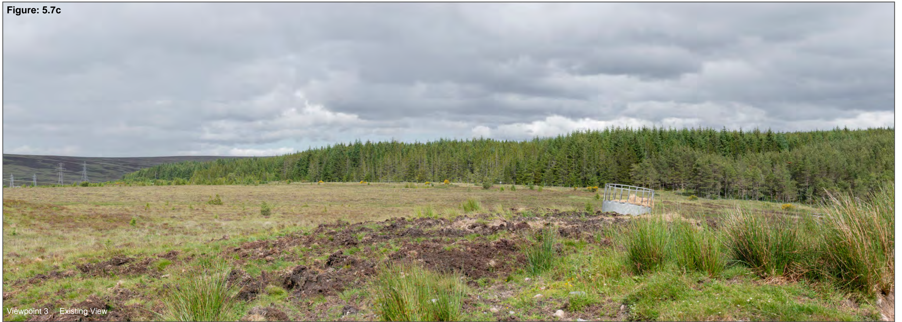
Viewpoint 3 Existing View