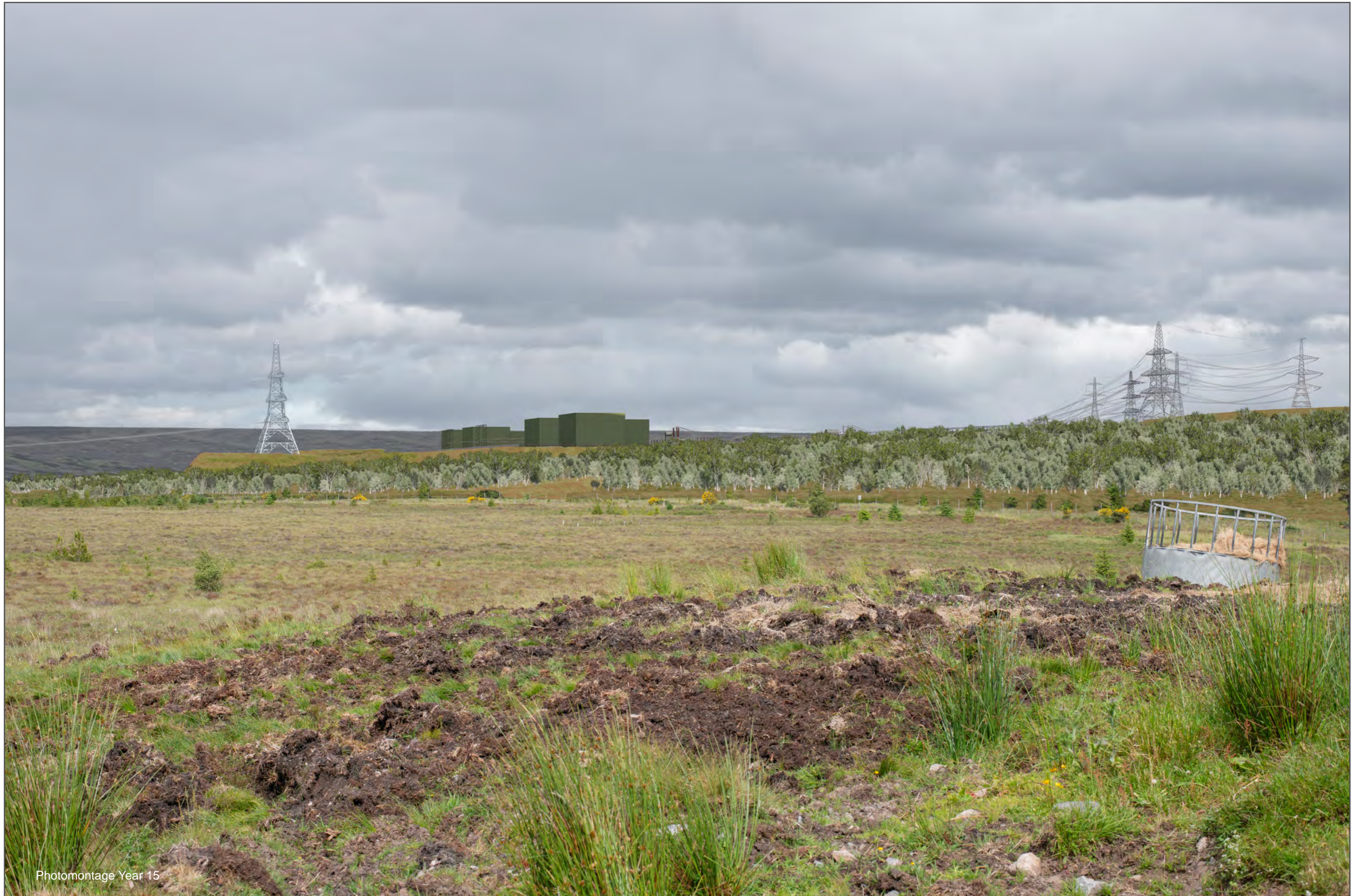
Figure: 5.7d Viewpoint 3 - Cumulative View Carnegie Road

This image should be viewed at a comfortable arm's length (approx 500mm)