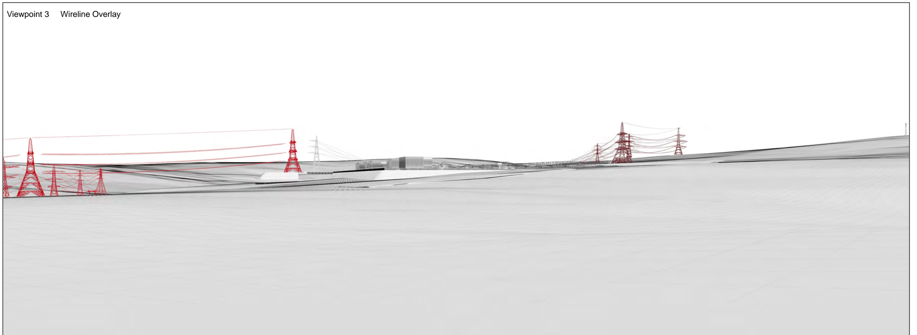
Viewpoint 3 Wireline Overlay