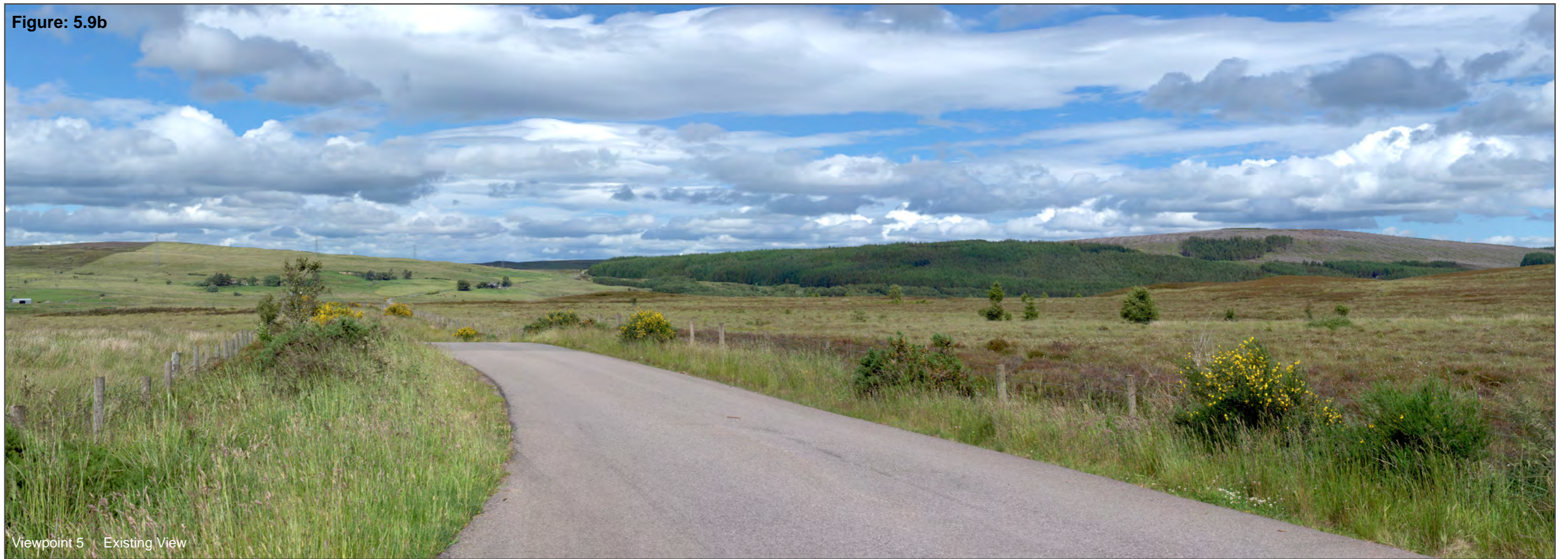
Viewpoint 5 Existing View