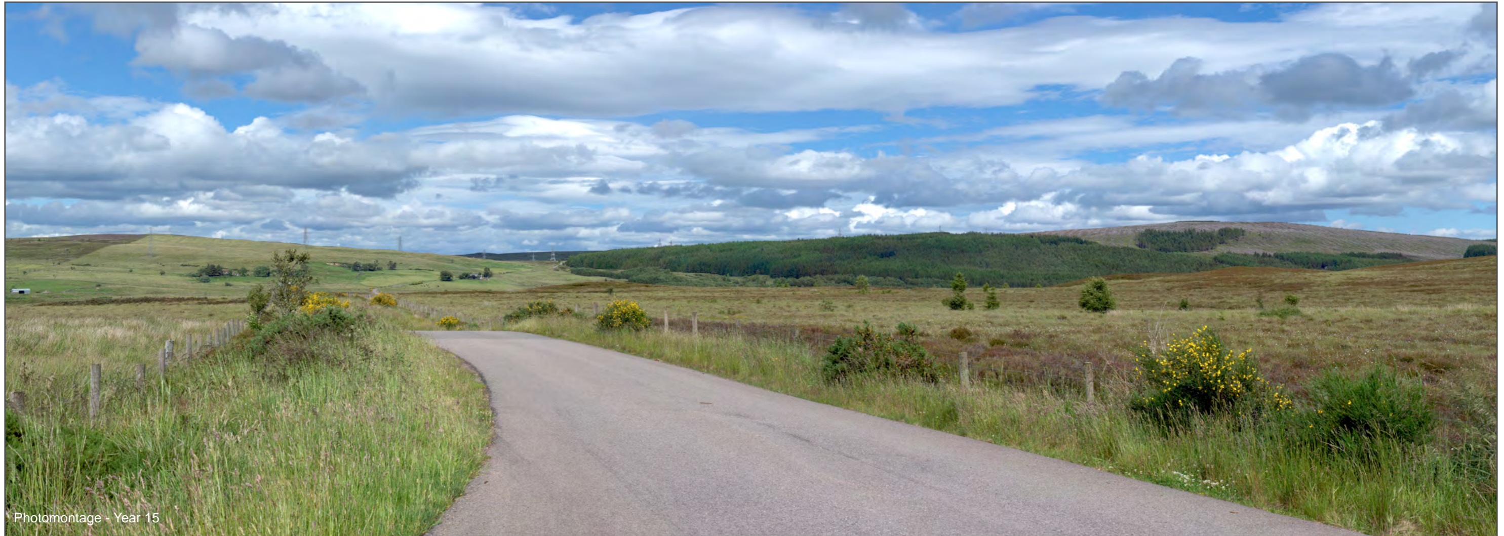
Figure: 5.9a Viewpoint 5 - Cumulative View Lochbuie Road (adjacent to Water Works)