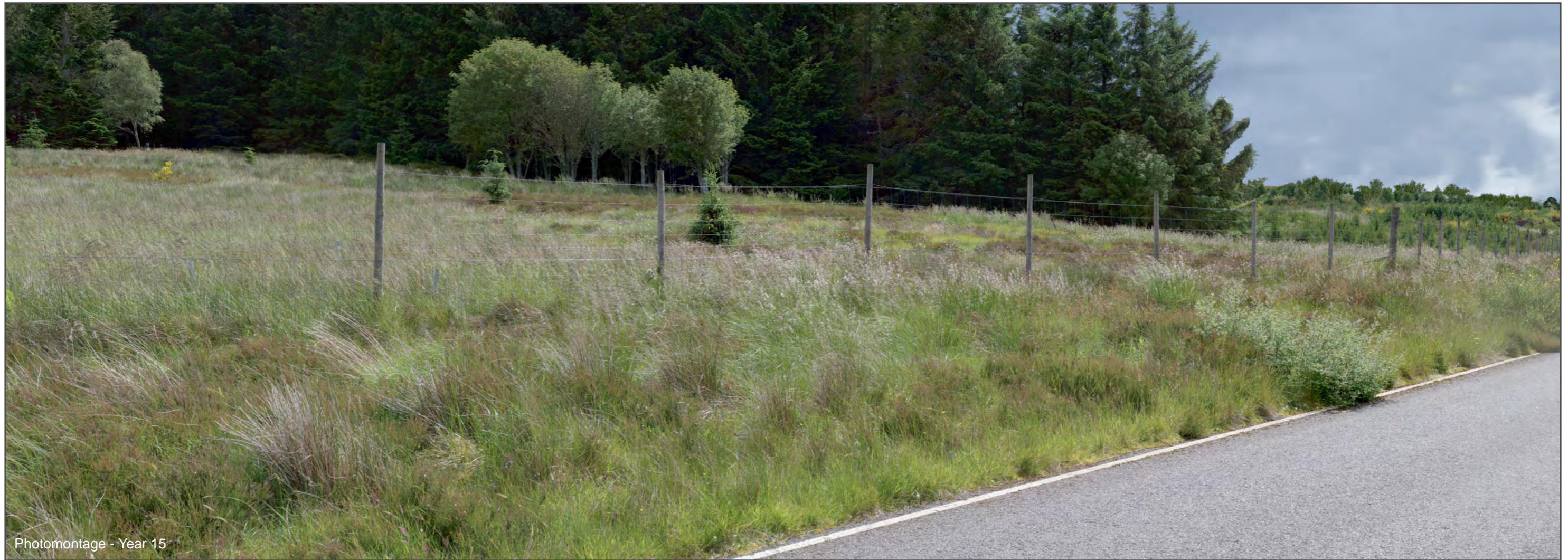
Figure: 5.5a Viewpoint 1 Lochbuie Road (west of existing substation)