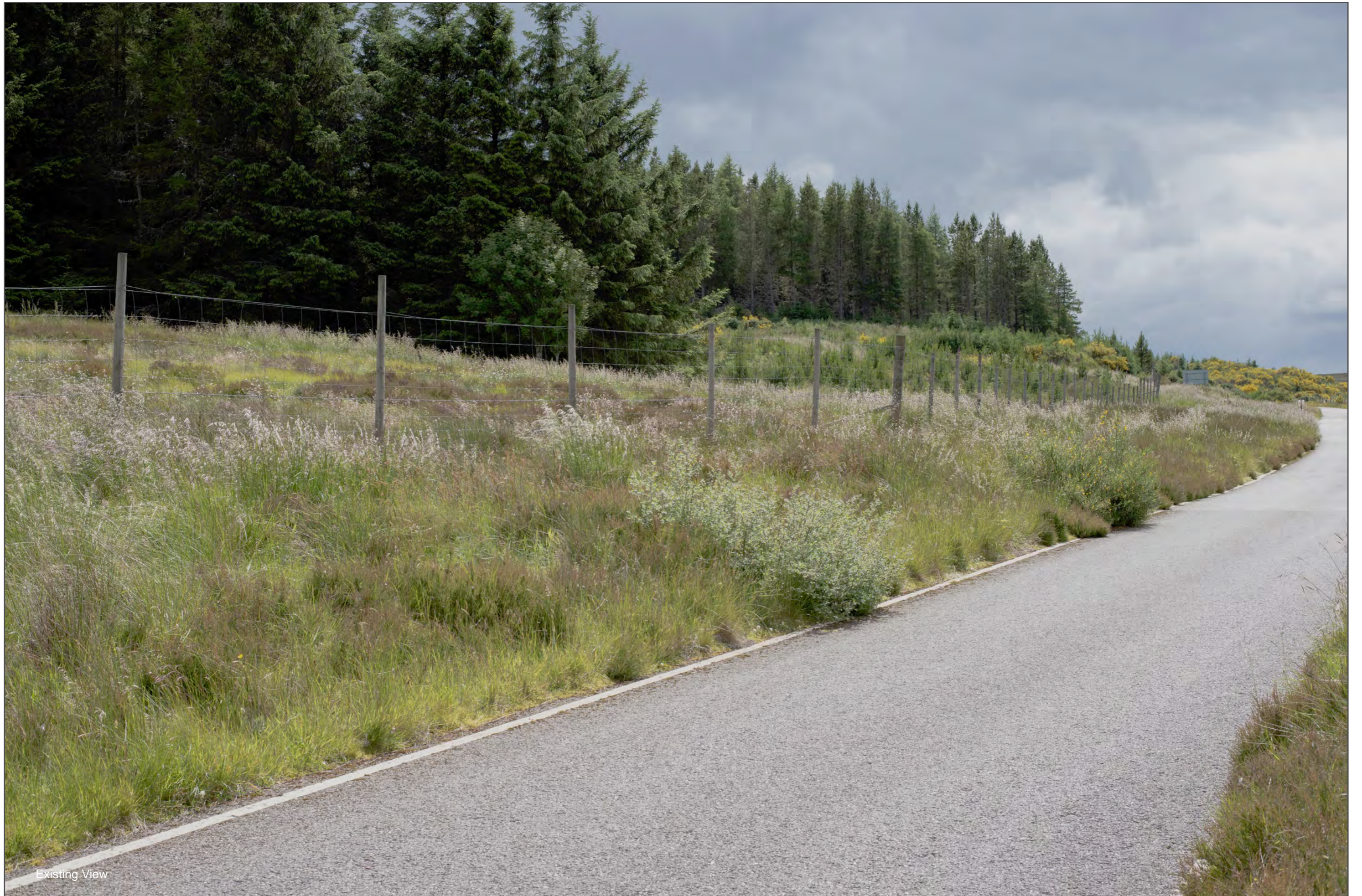
Figure: 5.5f Viewpoint 1

Lochbuie Road (west of existing substation)