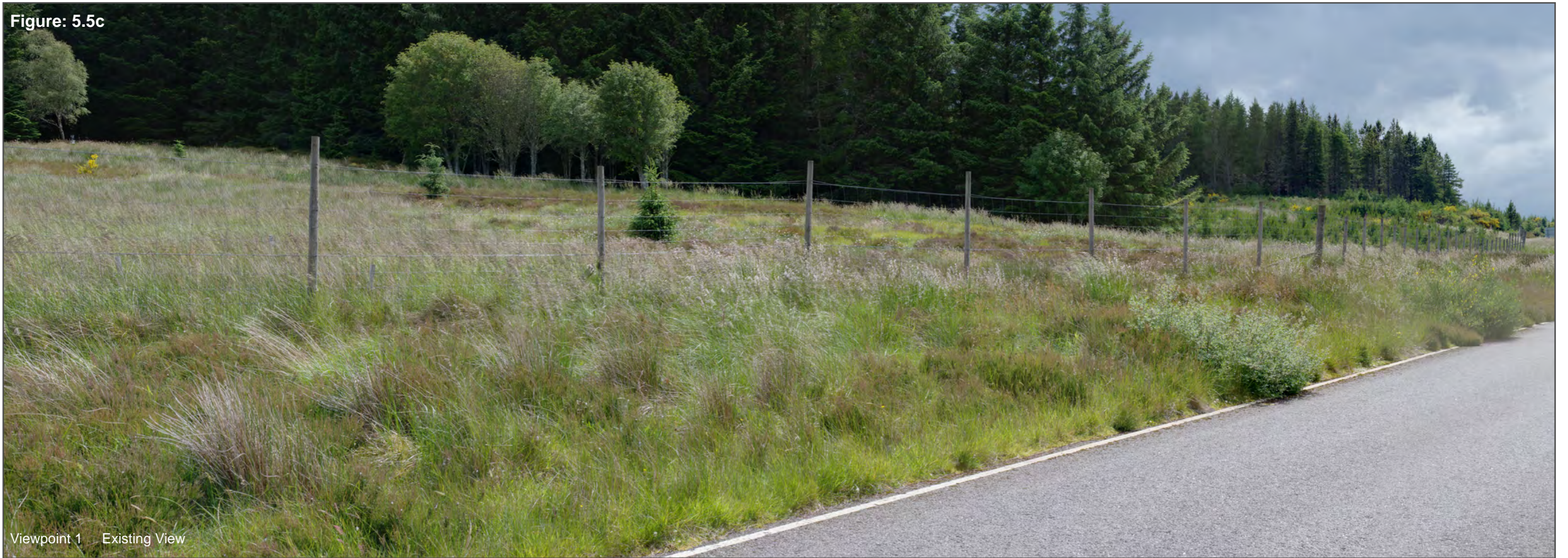
Viewpoint 1 Existing View