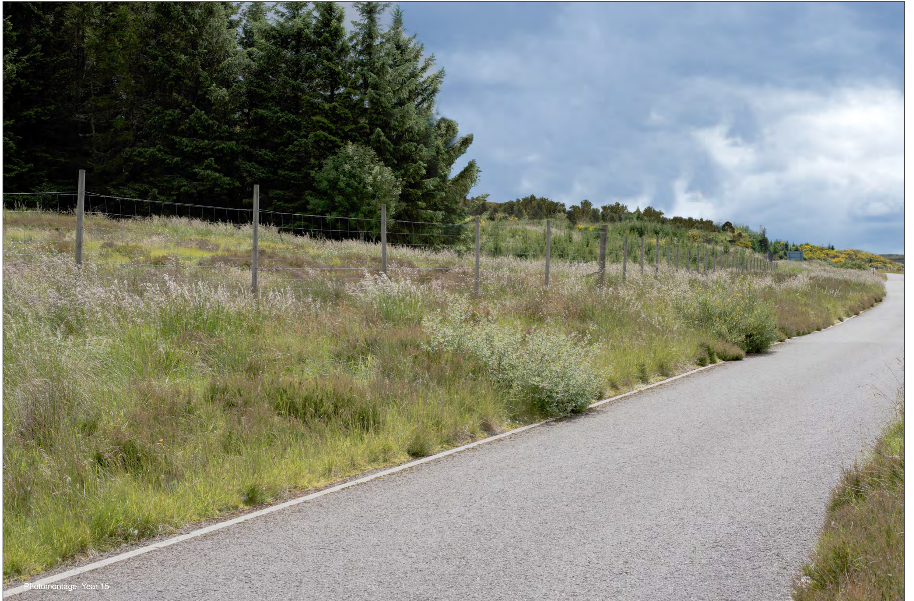
Figure: 5.5d Viewpoint 1

Lochbuie Road (west of existing substation)