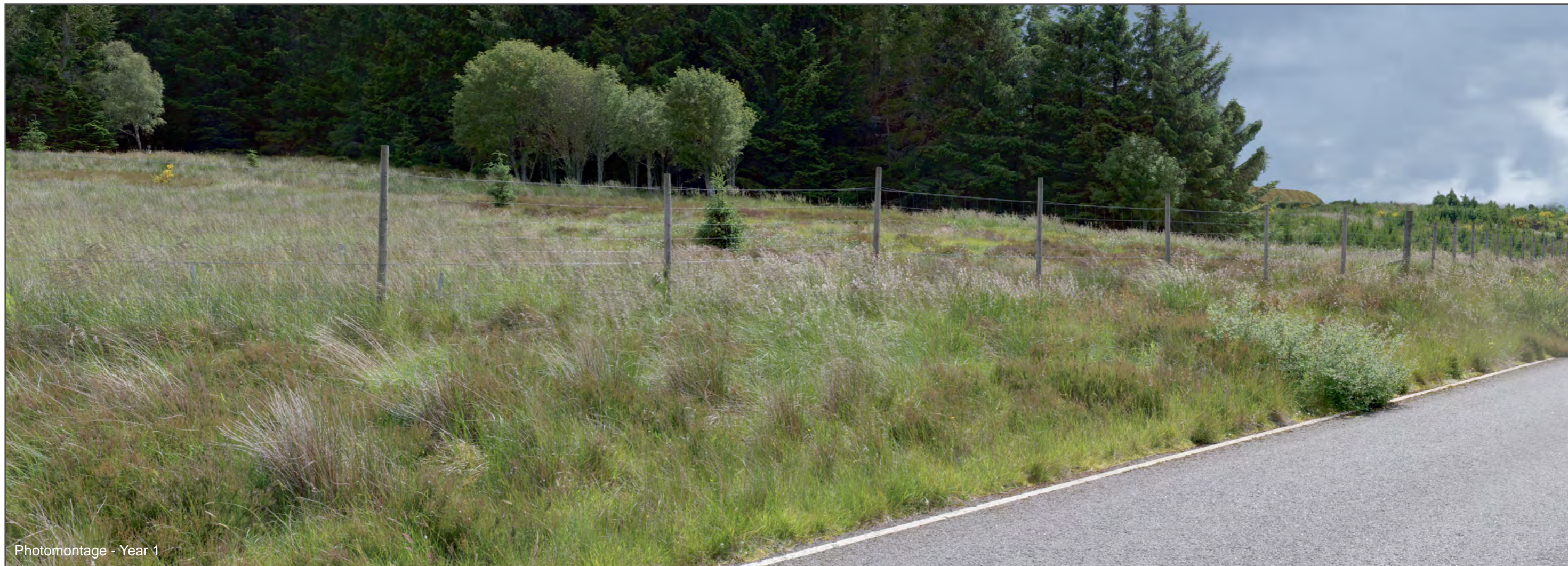
Figure: 5.5b Viewpoint 1 Lochbuie Road (west of existing substation)