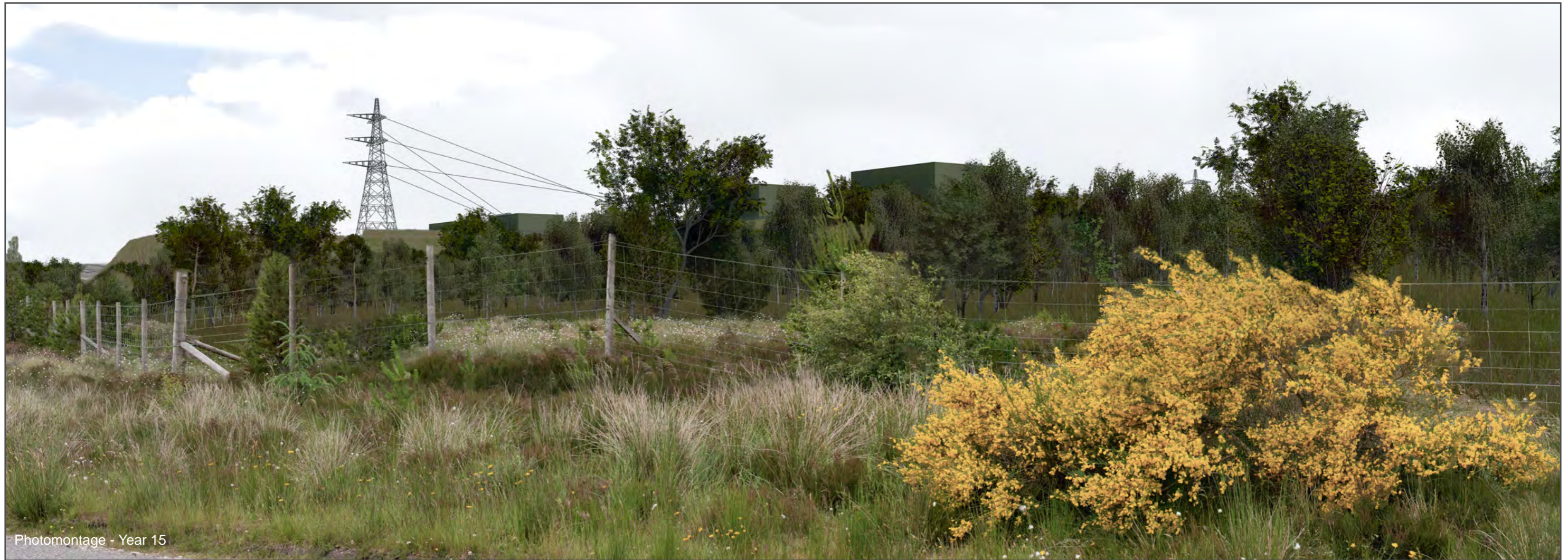
Figure: 5.6a Viewpoint 2

Lochbuie Road (in proximity to Proposed Development Access)