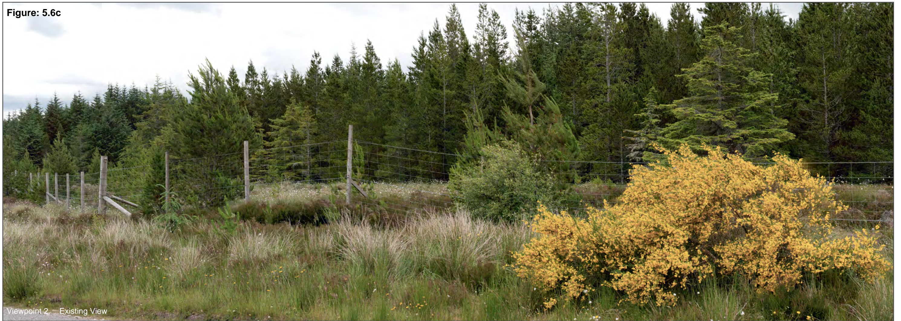
Viewpoint 2 Existing View