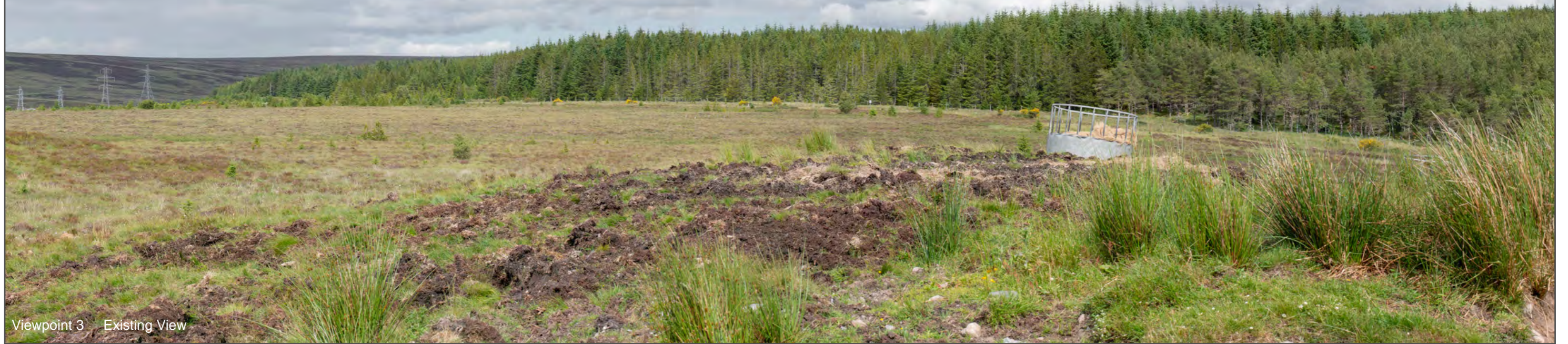
Viewpoint 3 Existing View