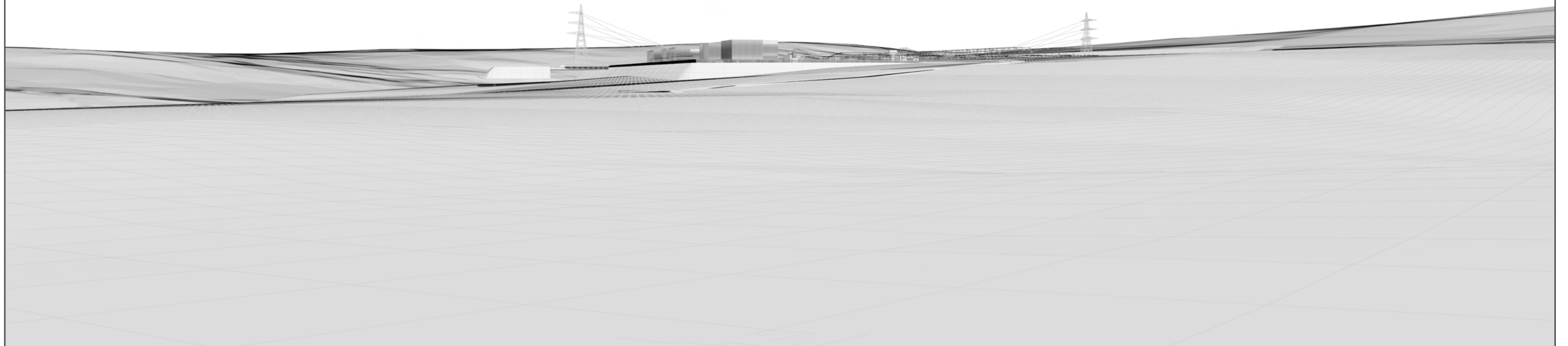
Viewpoint 3 Wireline Overlay