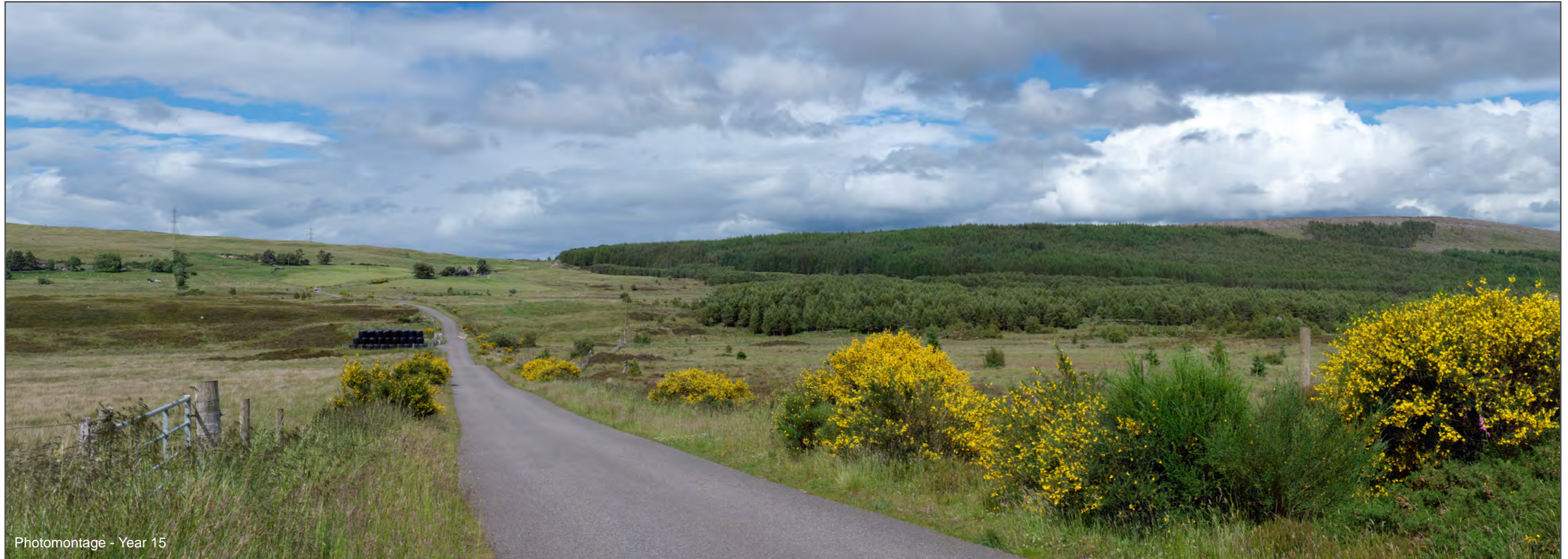
Figure: 5.8a Viewpoint 4 Lochbuie Road (south of An Uidh Crossing)