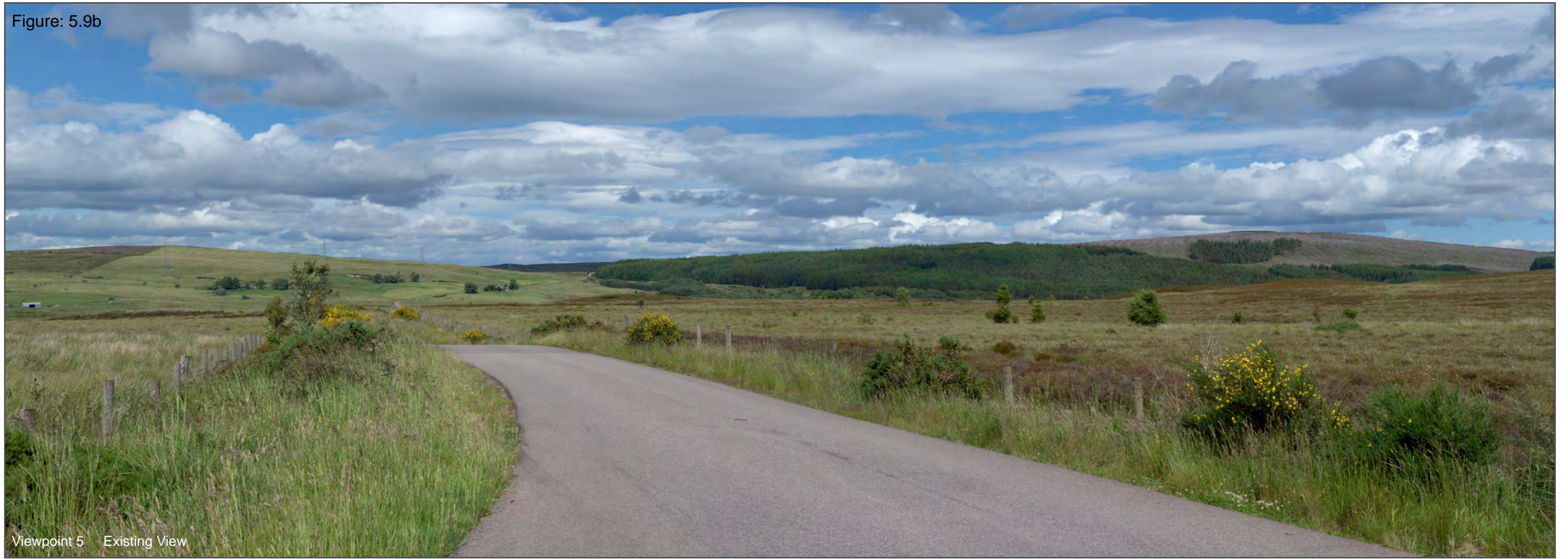
Viewpoint 5 Existing View