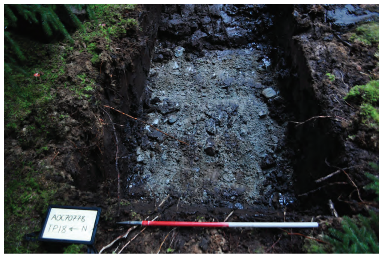
Plate 42: General view of TP18 post-excavation, looking East