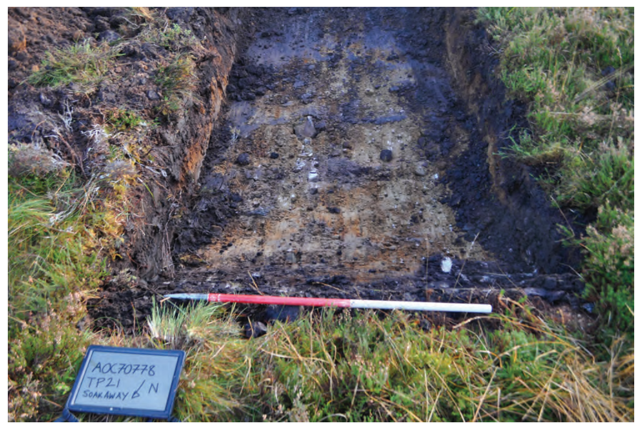
Plate 46: General view of TP21 soakaway post-excavation, looking southeast