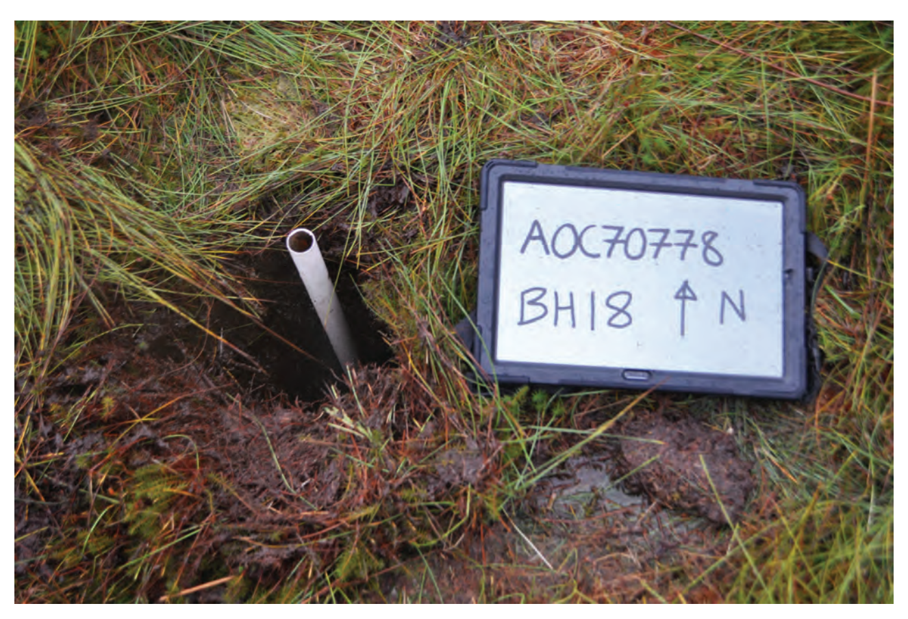
Plate 21: General view of BH18 post-excavation, looking north