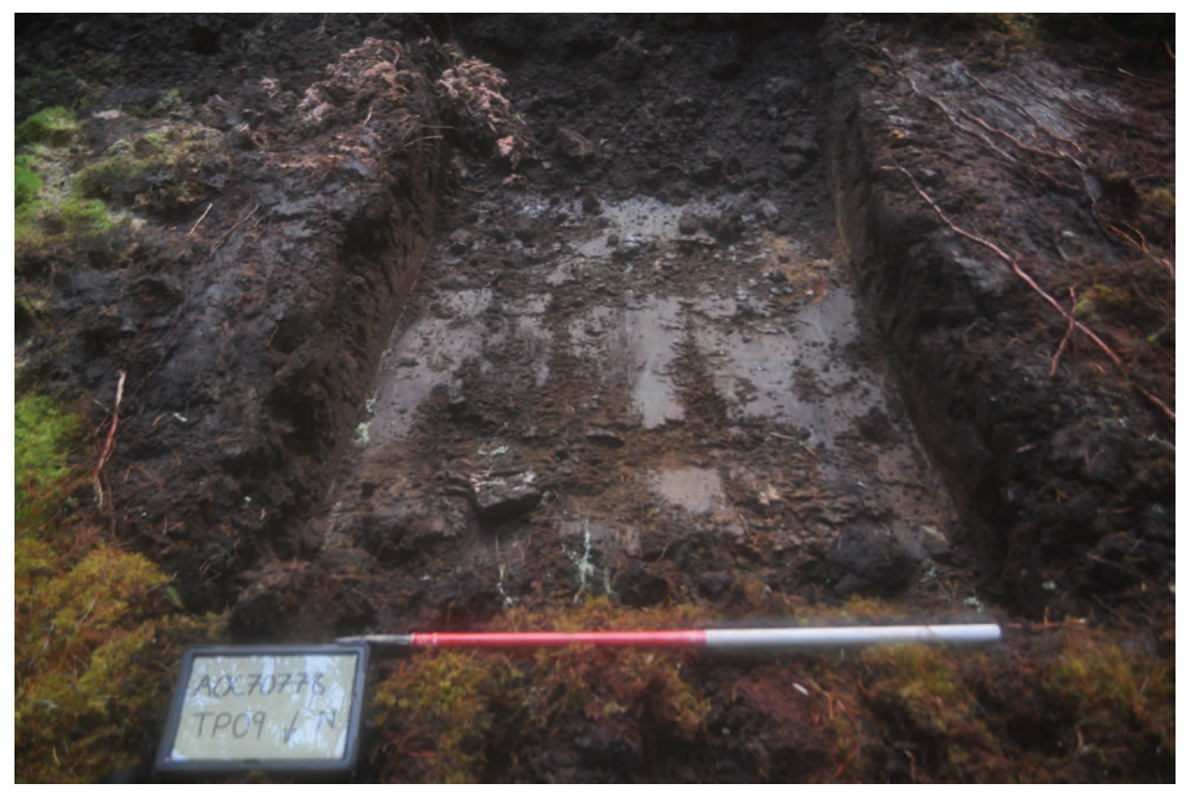
Plate 32: General view of TP09 post-excavation, looking south