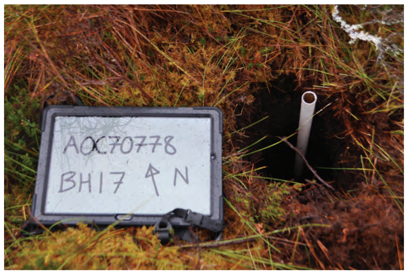
Plate 20: General view of BH17 post-excavation, looking northwest