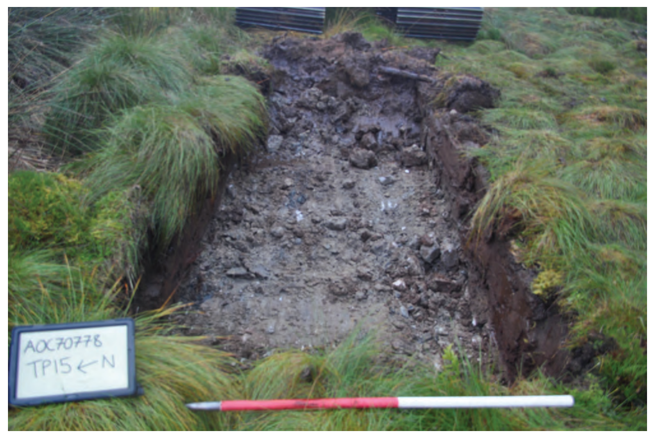
Plate 38: General view of TP15 post-excavation, looking southeast