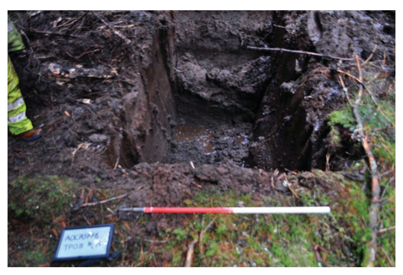
Plate 31: General view of TP08 mid-excavation, looking northeast