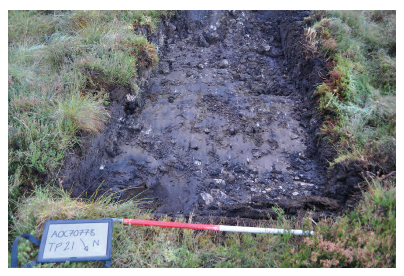
Plate 45: General view of TP21 post-excavation, looking southwest