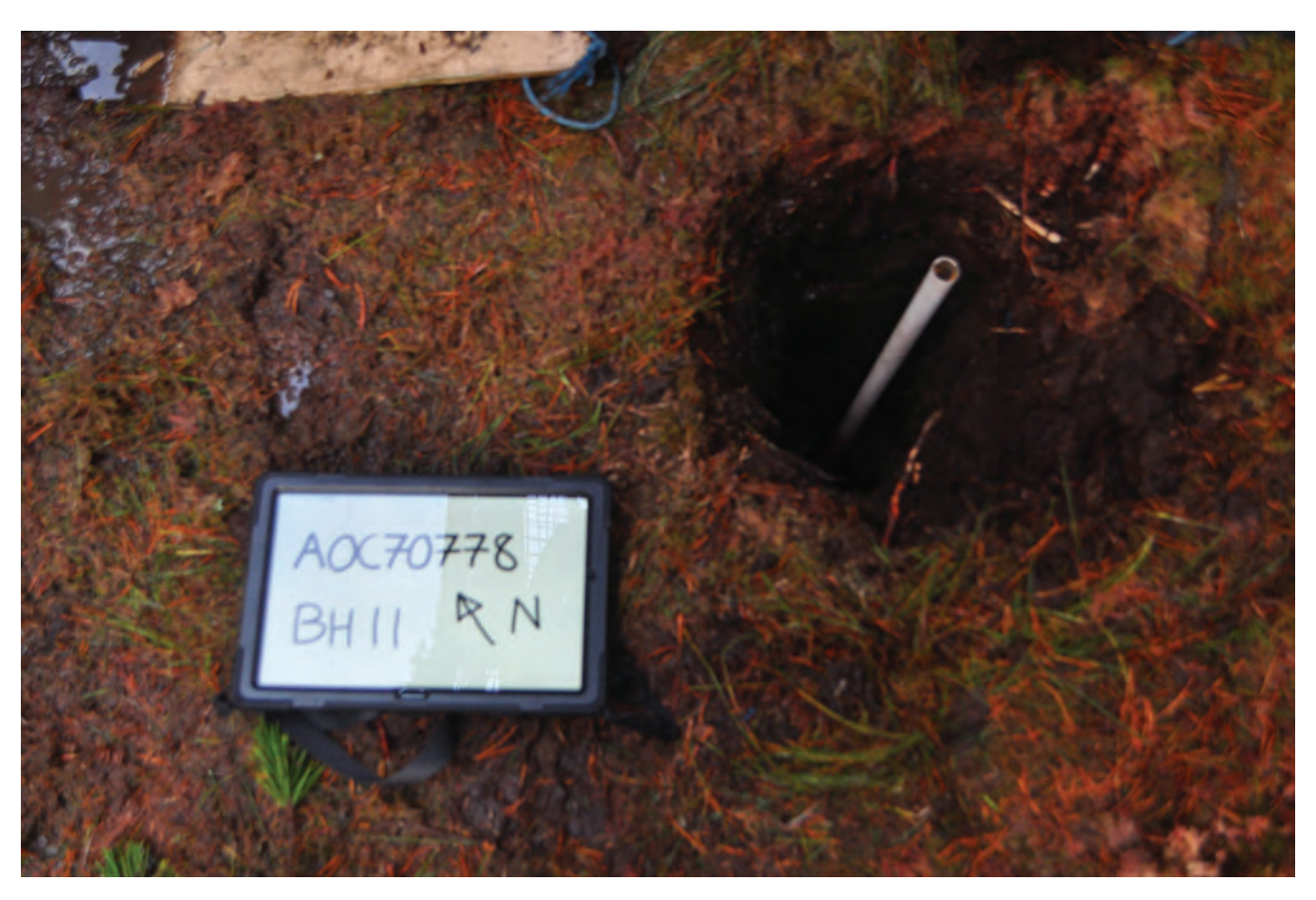
Plate 15: General view of BH11 post-excavation, looking northeast