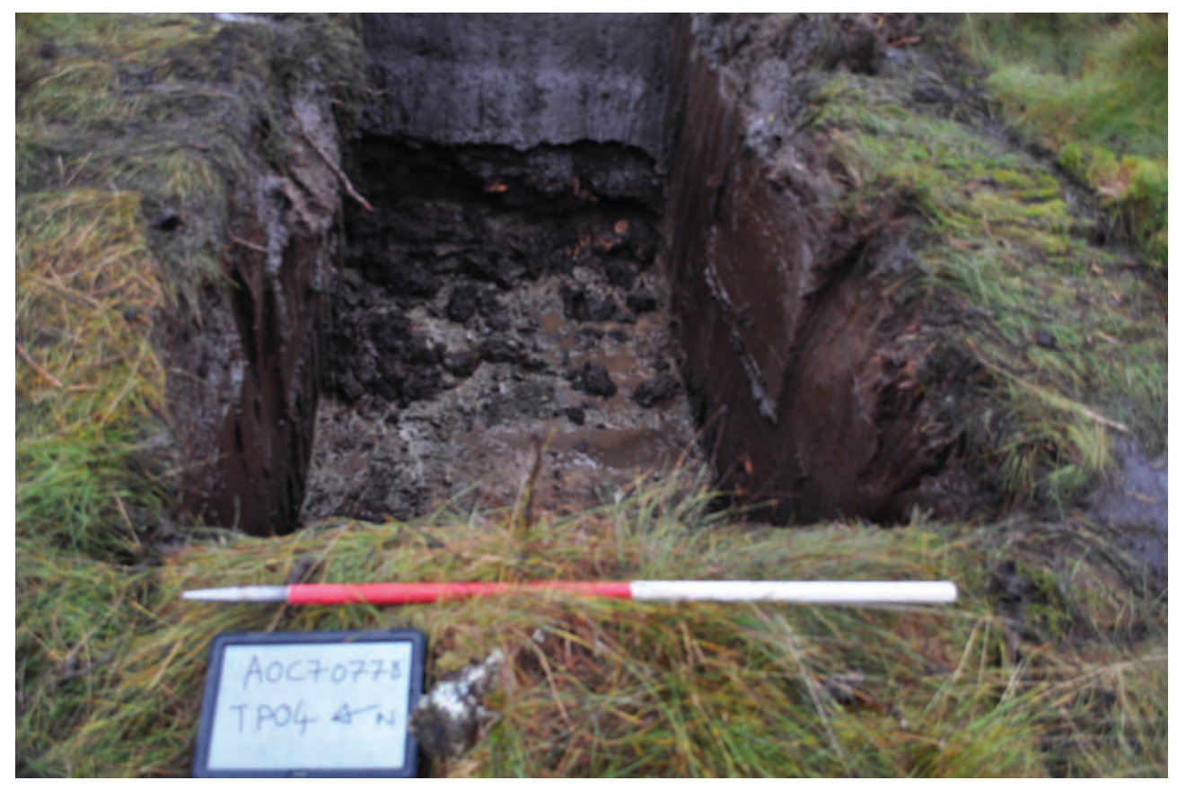
Plate 26: General view of TP04 post-excavation, looking East