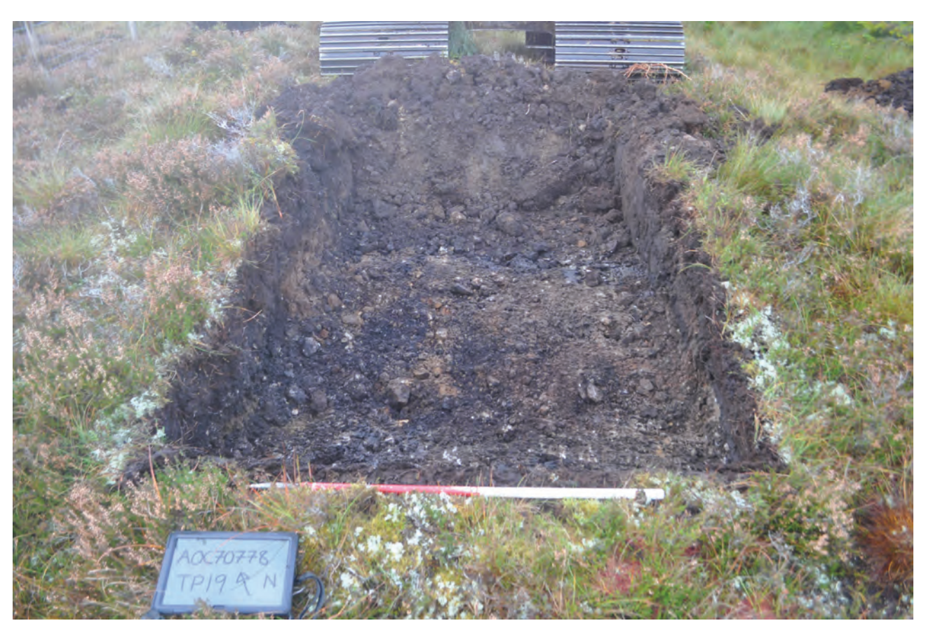
Plate 43: General view of TP19 post-excavation, looking northeast