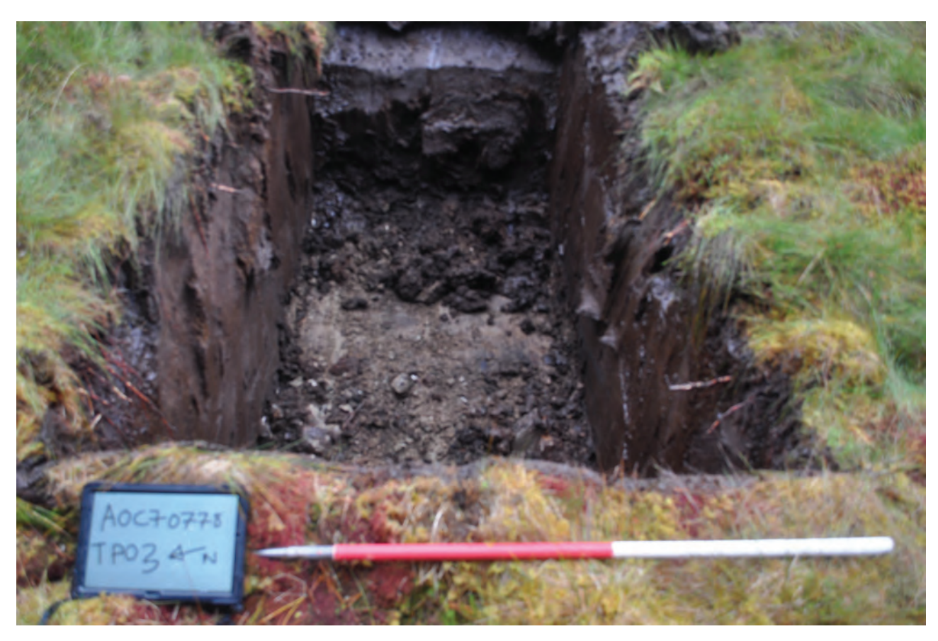
Plate 25: General view of TP03 post-excavation, looking East