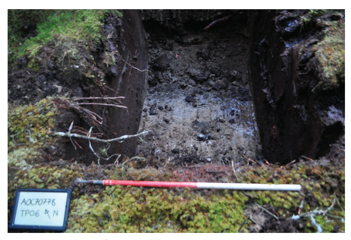
Plate 29: General view of TP06 post-excavation, looking northeast