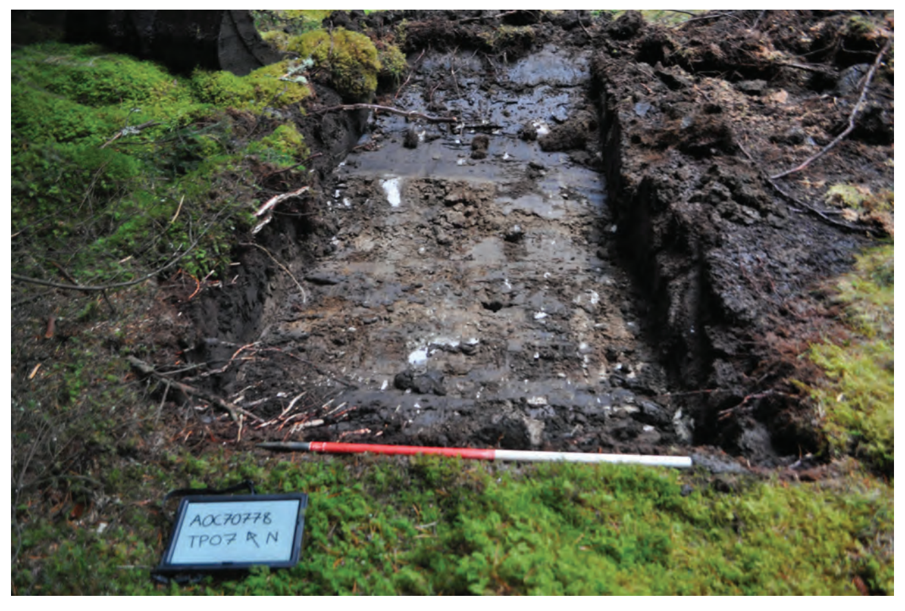
Plate 30: General view of TP07 post-excavation, looking northeast