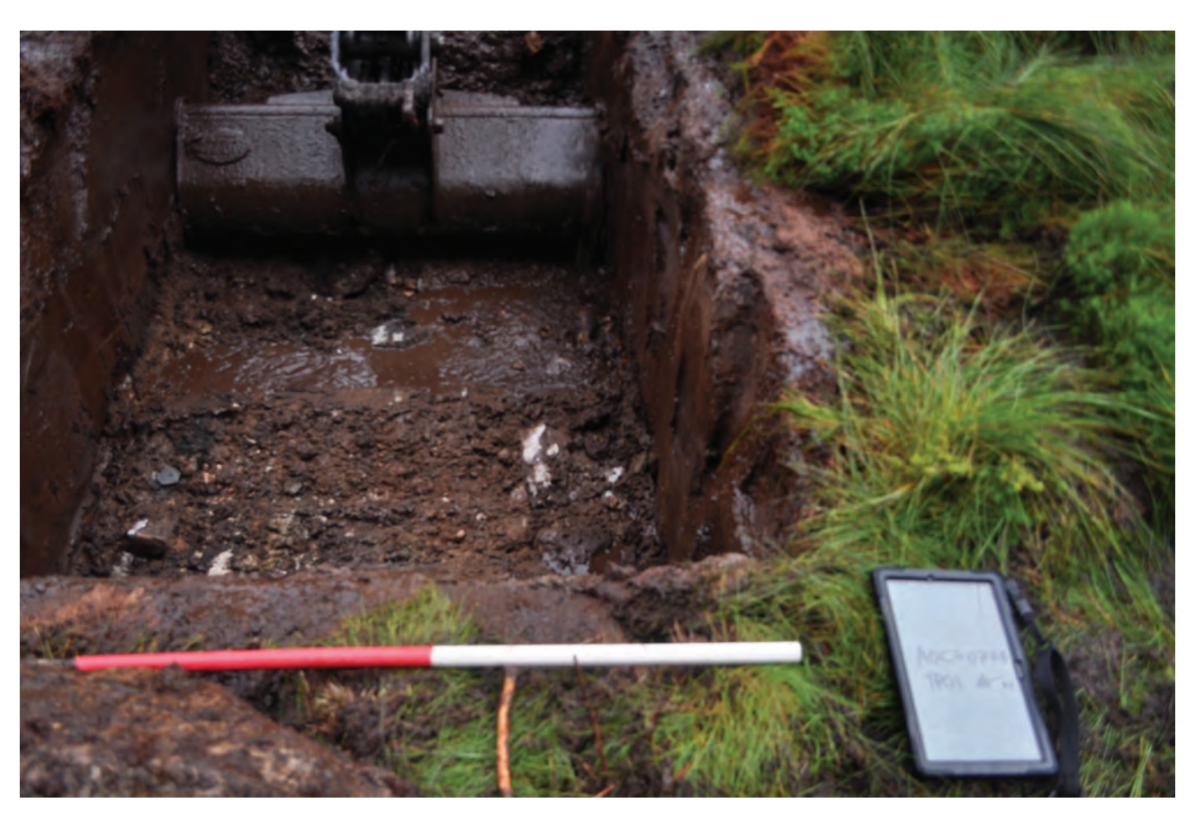
Plate 23: General view of TP01 post-excavation, looking East