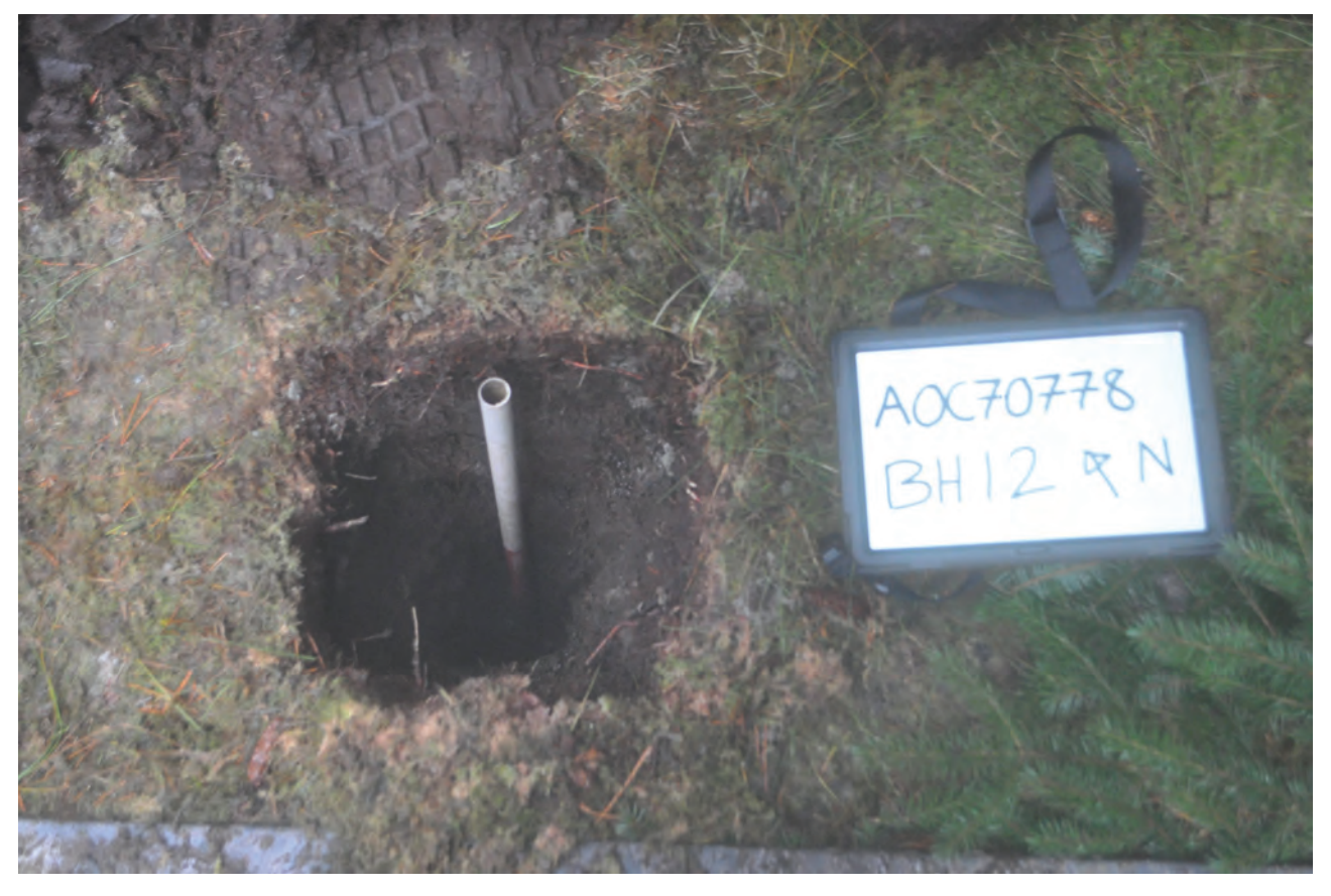
Plate 16: General view of BH12 post-excavation, looking northeast