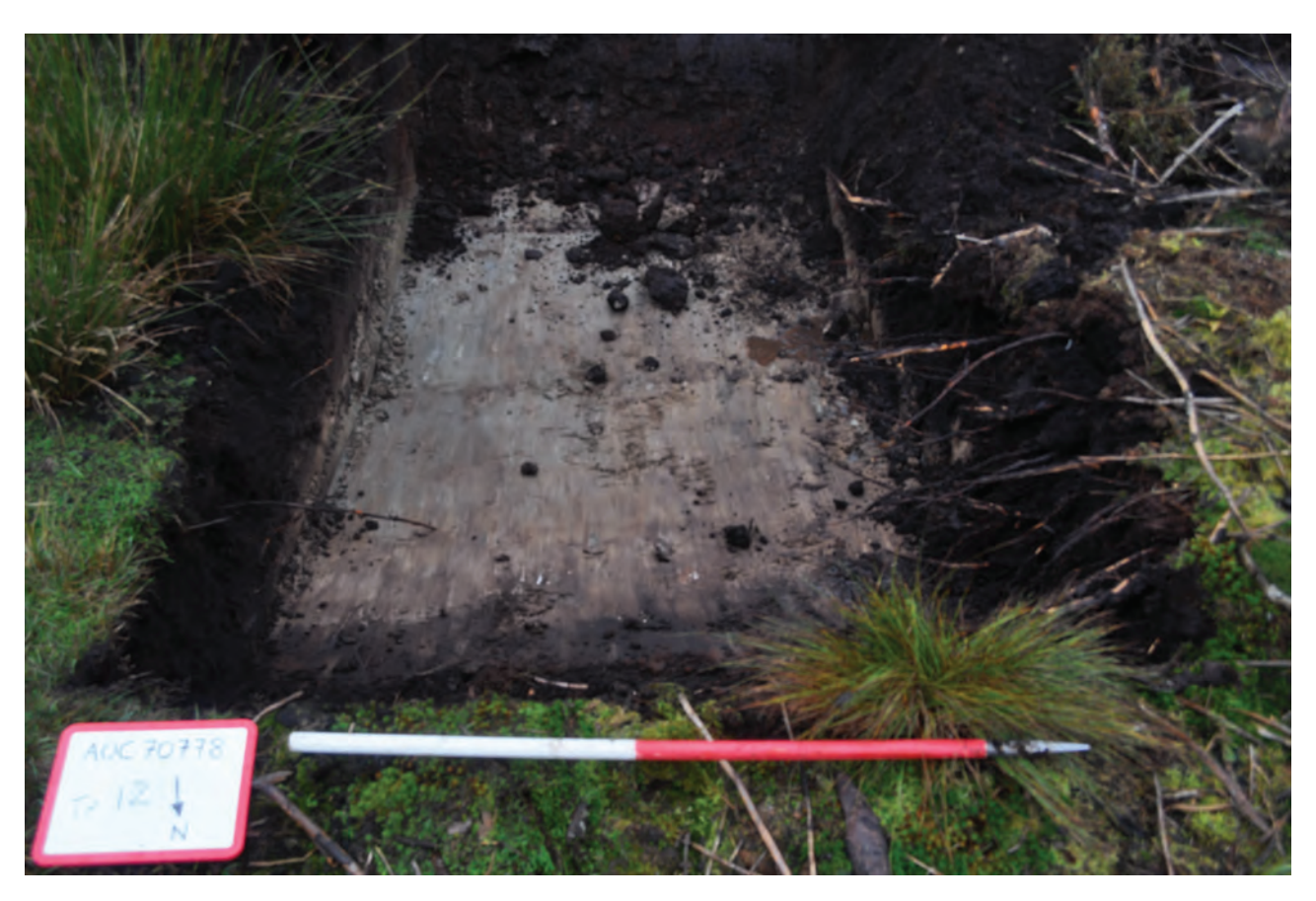
Plate 35: General view of TP12 post-excavation, looking south