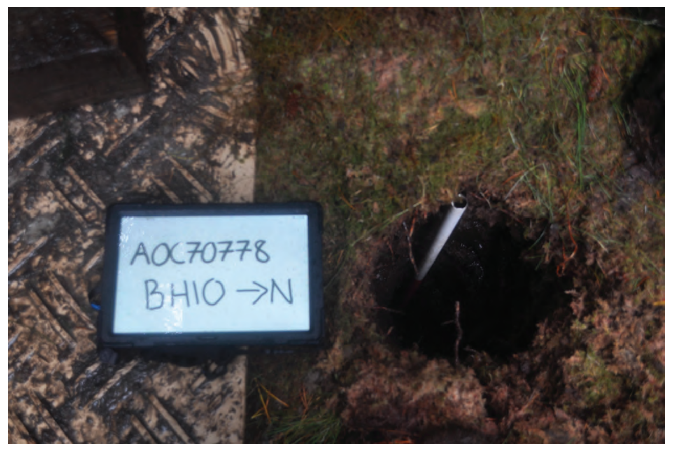
Plate 14: General view of BH10 post-excavation, looking west