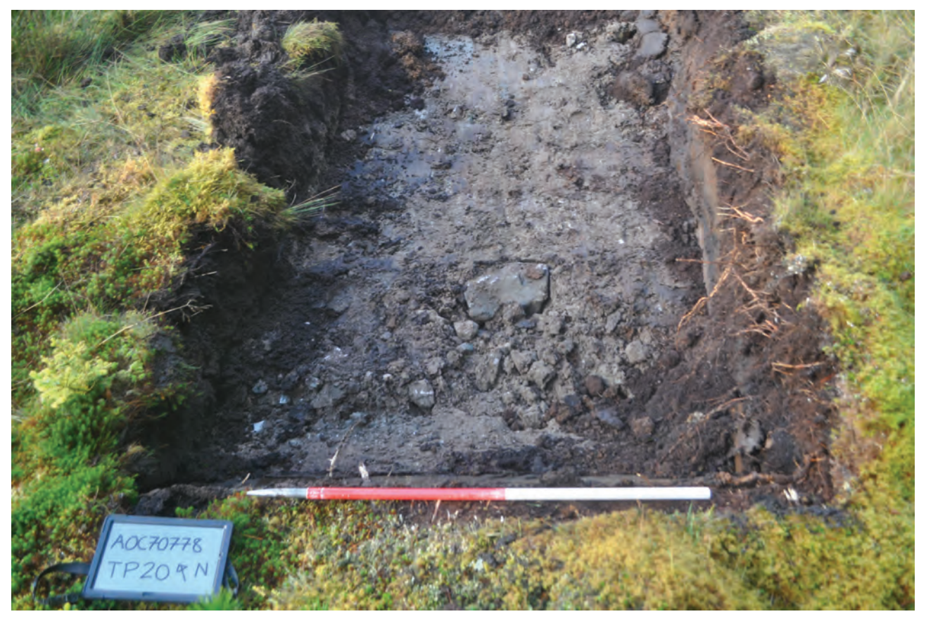
Plate 44: General view of TP20 post-excavation, looking northeast