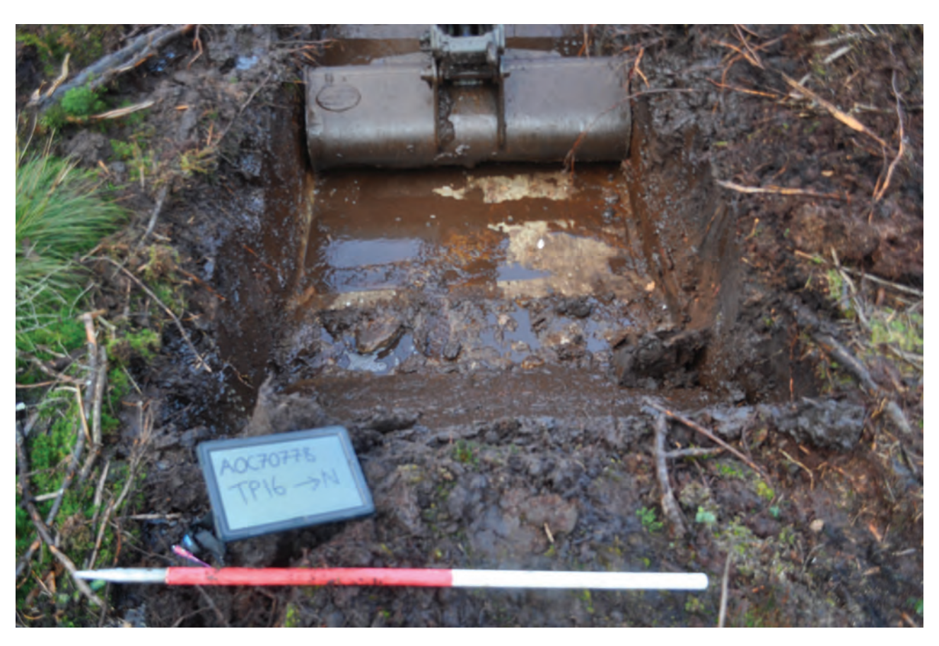
Plate 39: General view of TP16 post-excavation, looking northwest