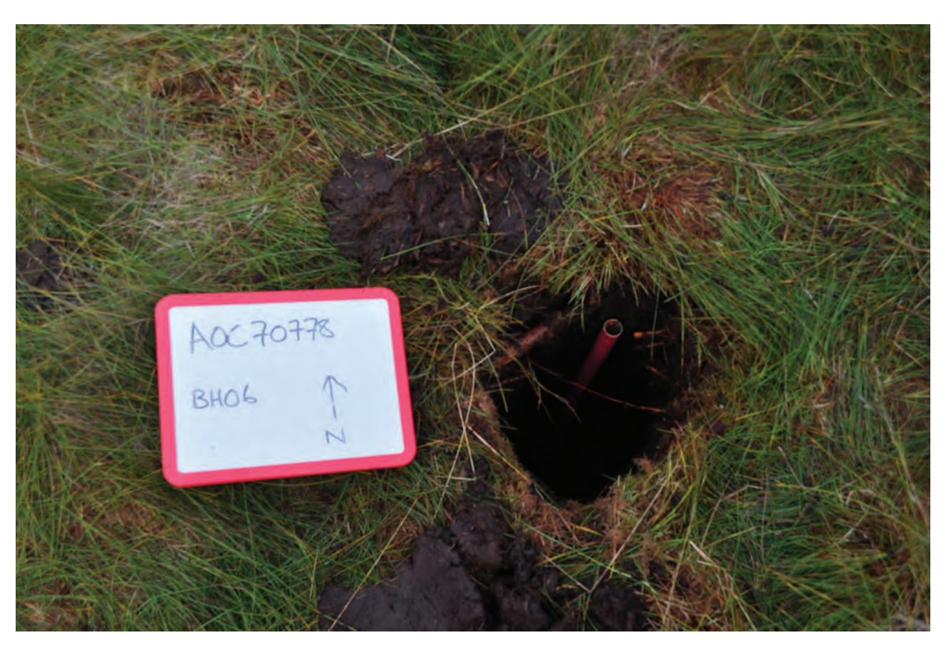
Plate 9: General view of BH06 post-excavation, looking north