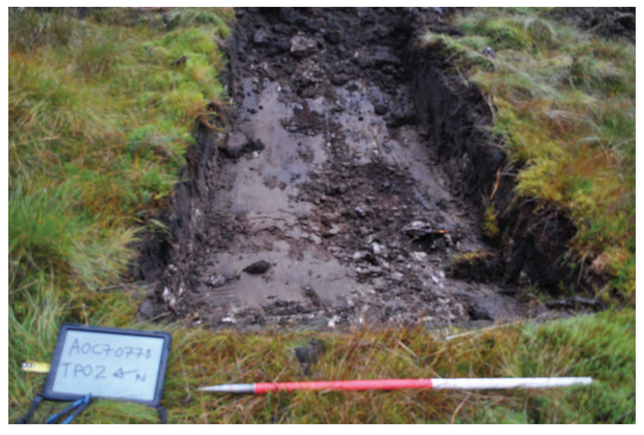
Plate 24: General view of TP02 post-excavation, looking East