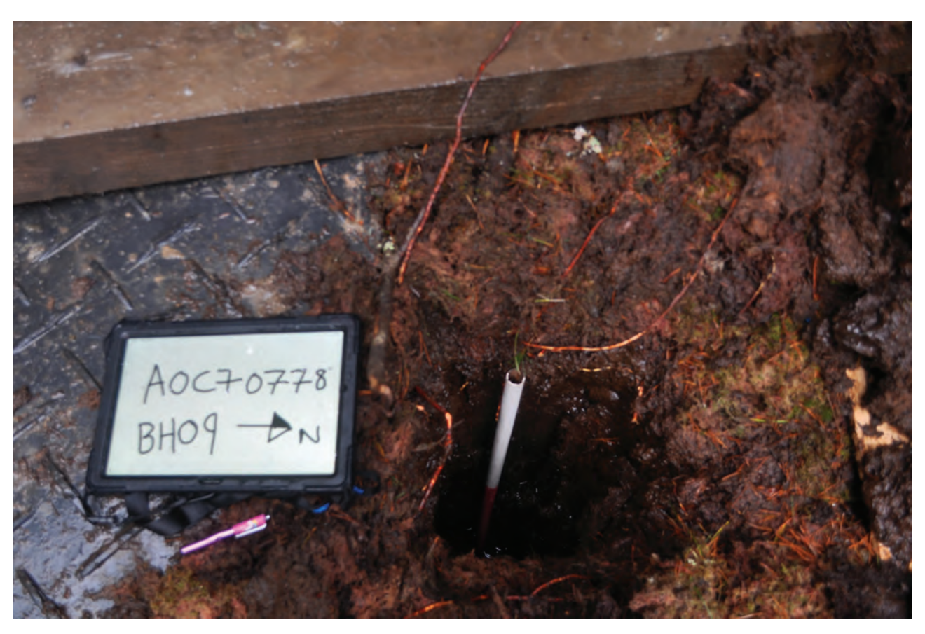
Plate 13: General view of BH09 post-excavation, looking west