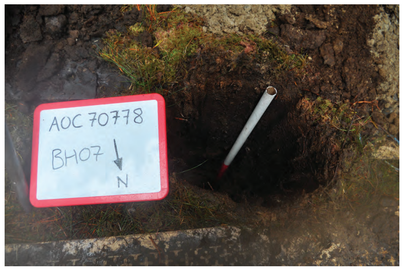
Plate 10: General view of BH07 post-excavation, looking south