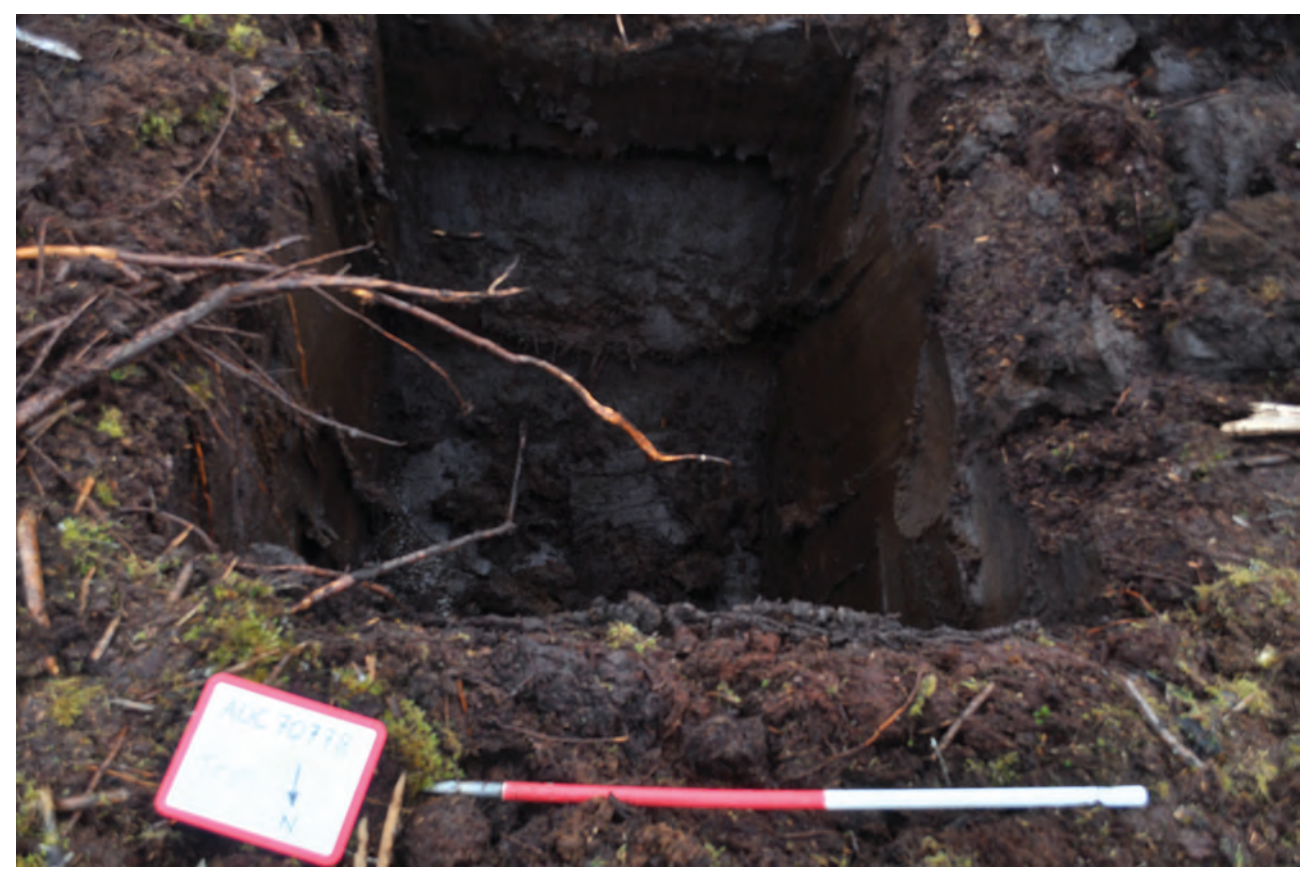
Plate 28: General view of TP05 post-excavation, looking SSE