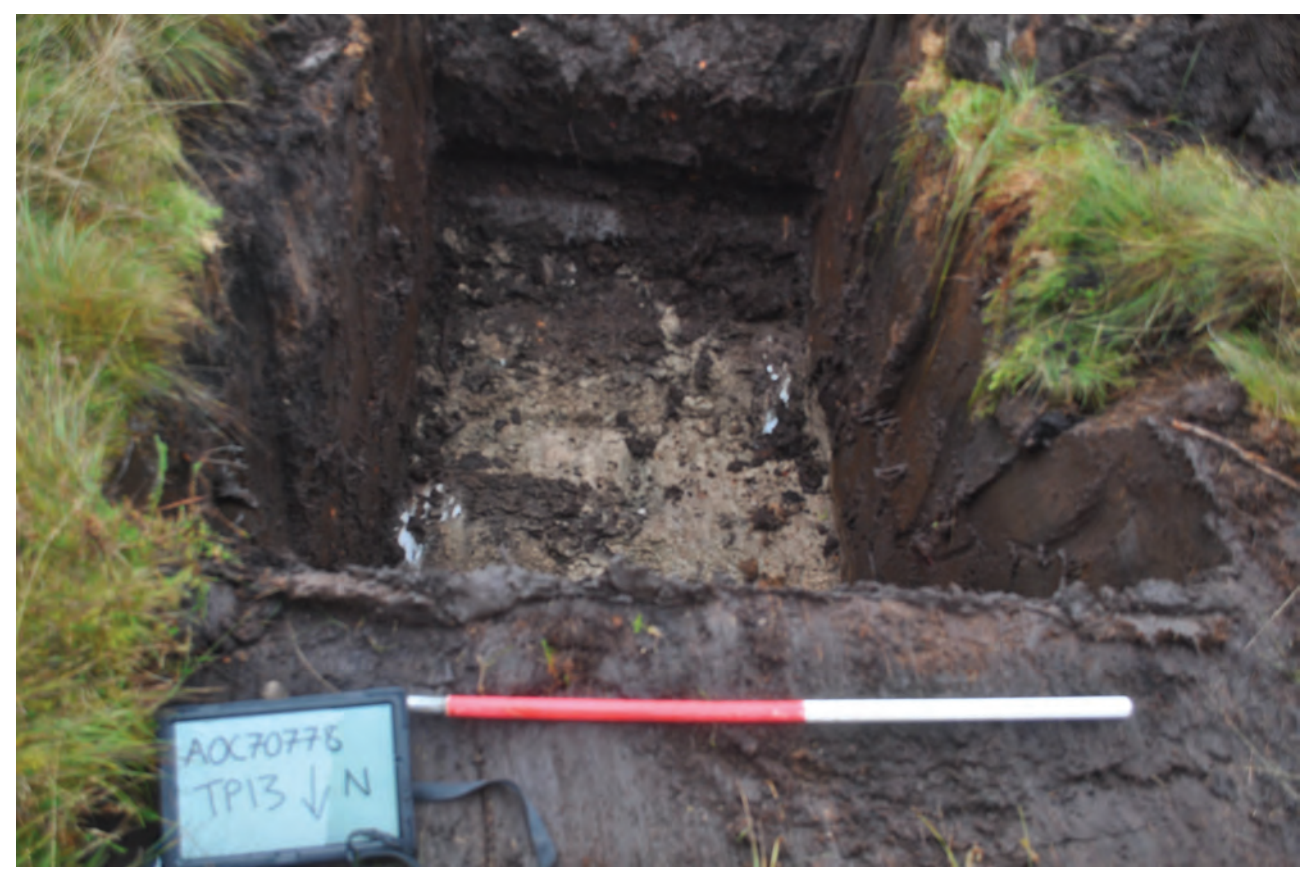
Plate 36: General view of TP13 post-excavation, looking south