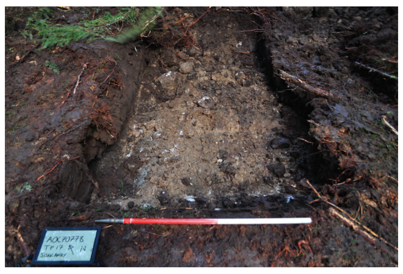
Plate 41: General view of TP17 soakaway post-excavation, looking northeast