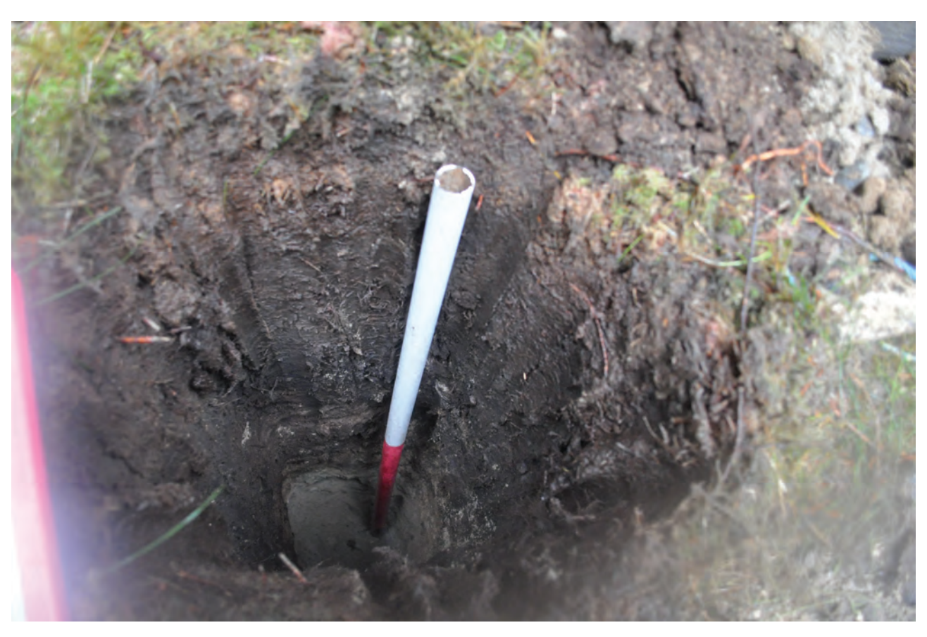
Plate 11: Detailed view of BH07 interior post-excavation, looking south