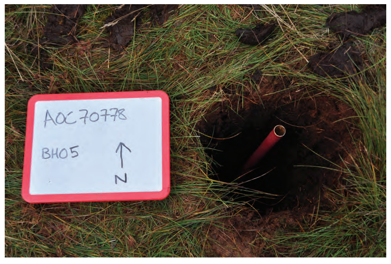
Plate 8: General view of BH05 post-excavation, looking north