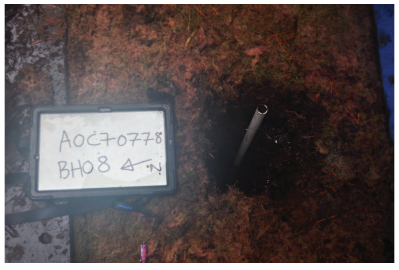
Plate 12: General view of BH08 post-excavation, looking East