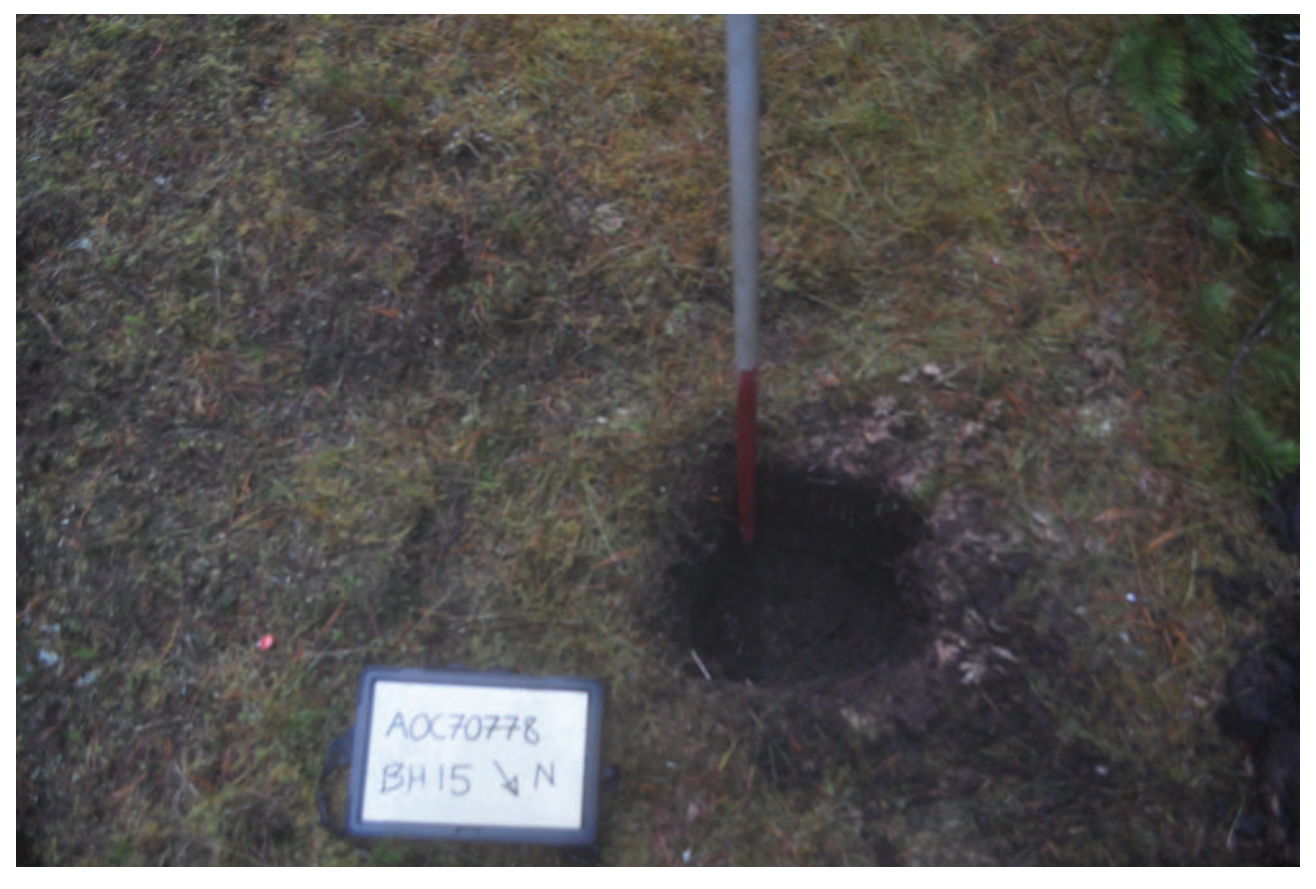
Plate 18: General view of BH15 post-excavation, looking southwest