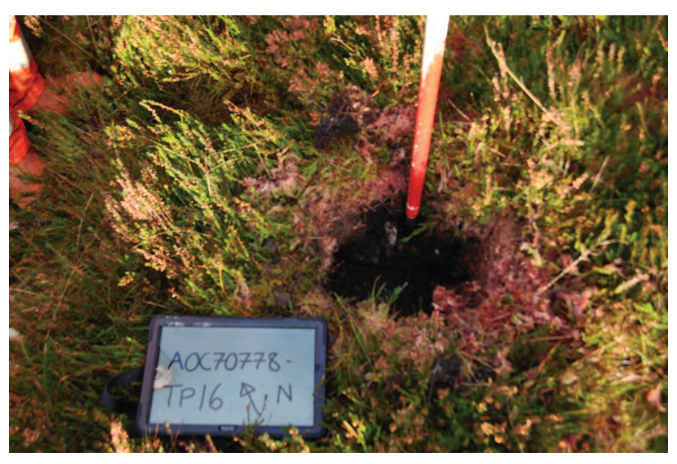
Plate 19: General view of BH16 post-excavation, looking northeast