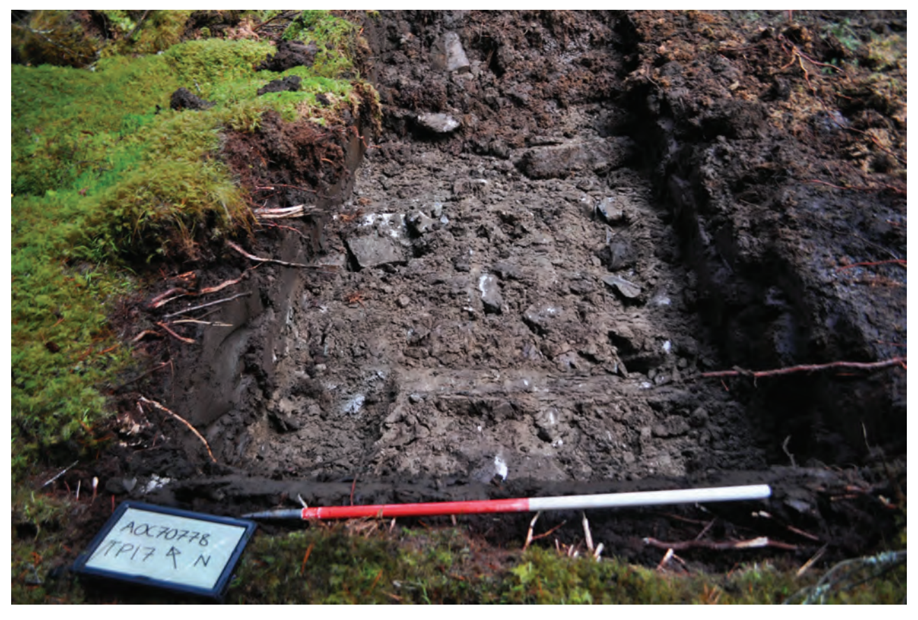
Plate 40: General view of TP17 post-excavation, looking northeast