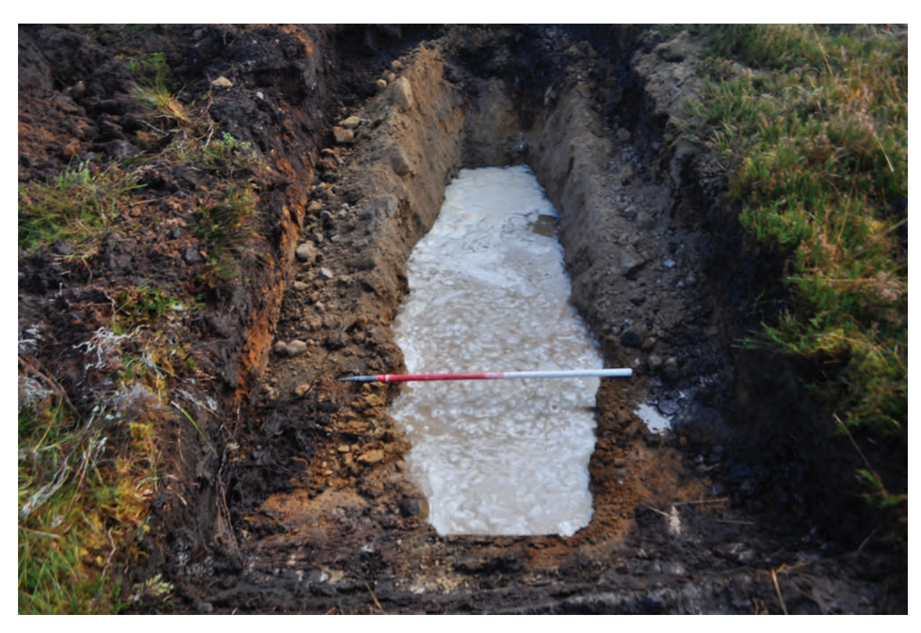
Plate 47: General view of TP21 soakaway during test, looking southeast