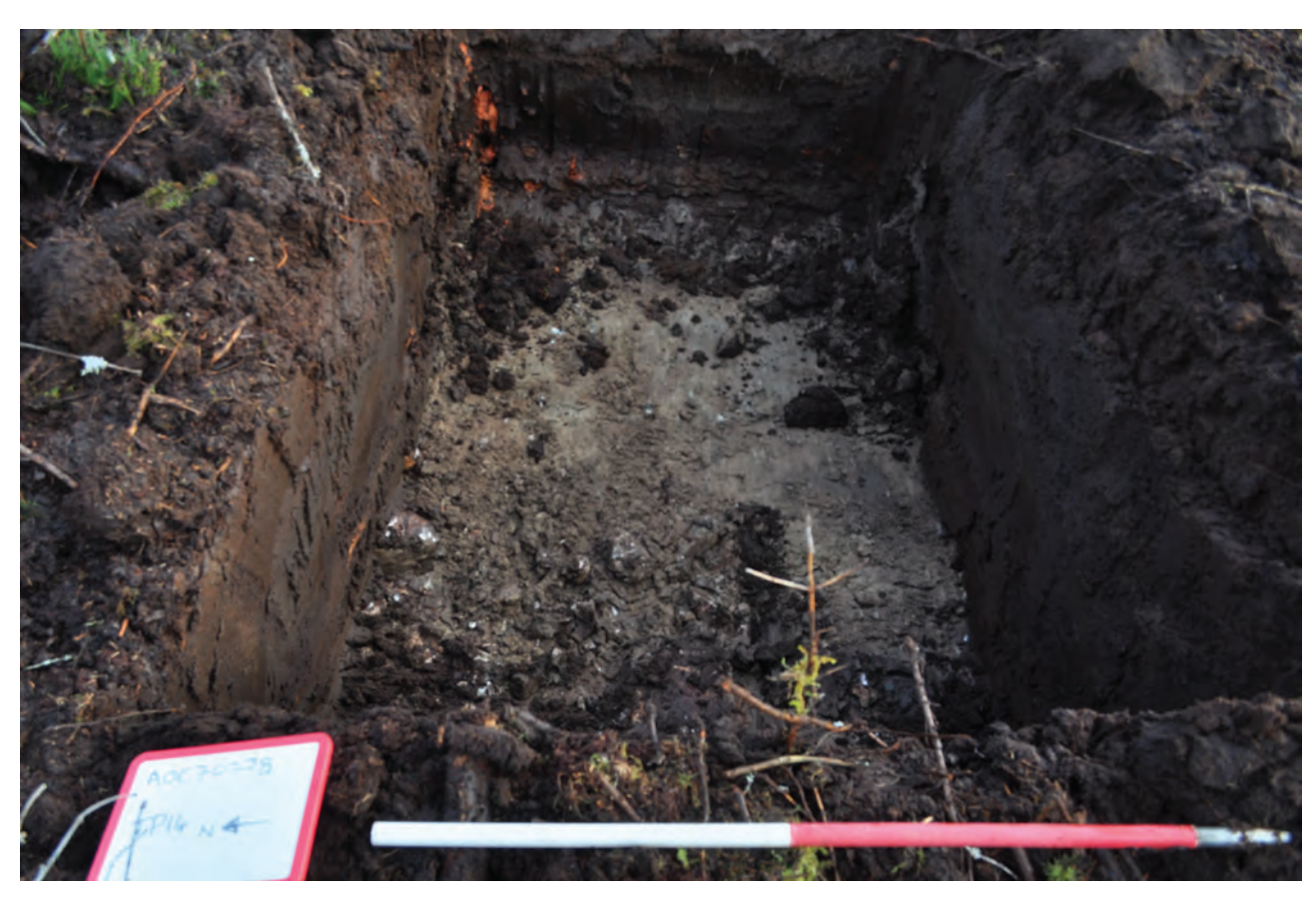
Plate 37: General view of TP14 post-excavation, looking East