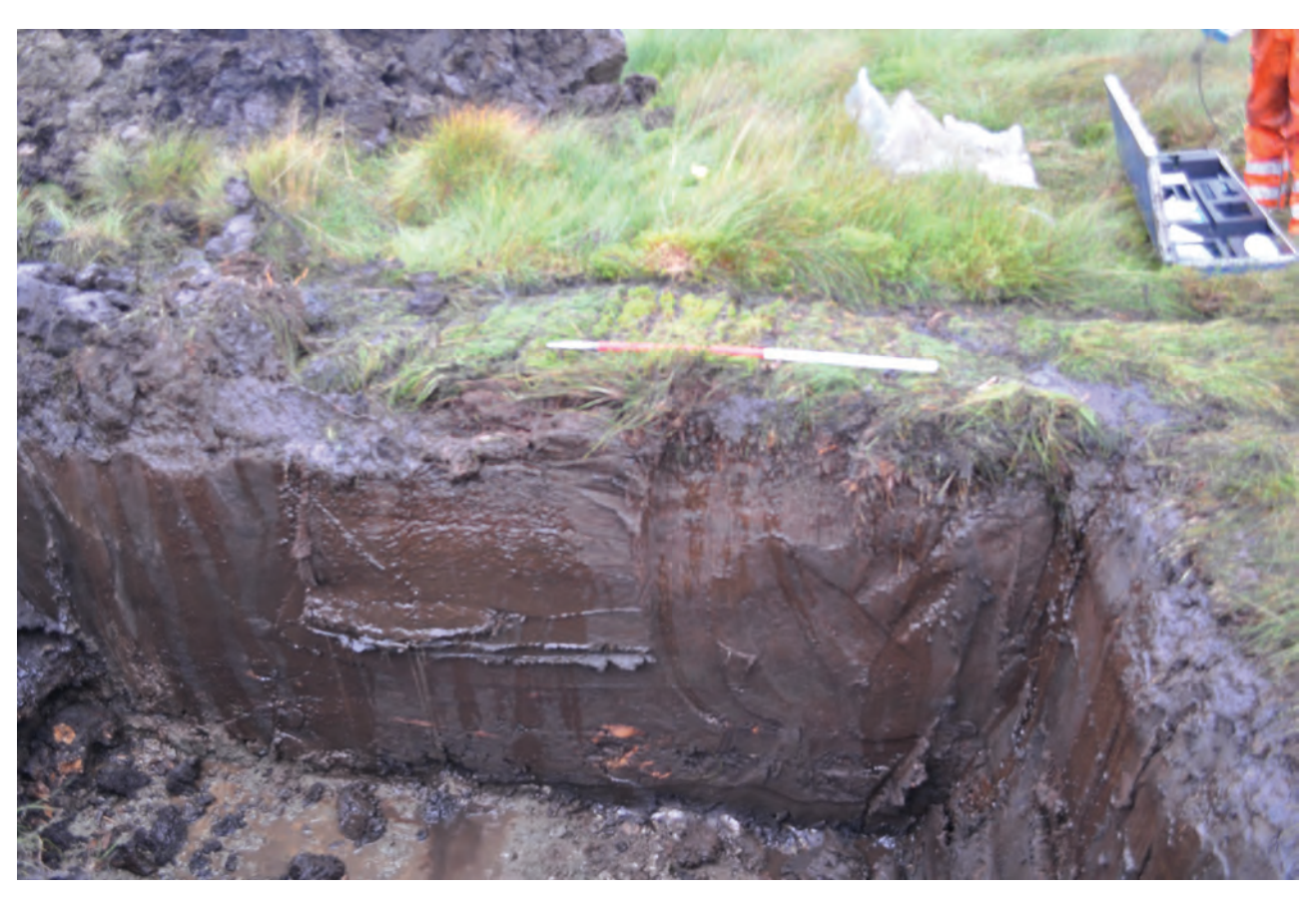
Plate 27: North facing section of TP04, looking south