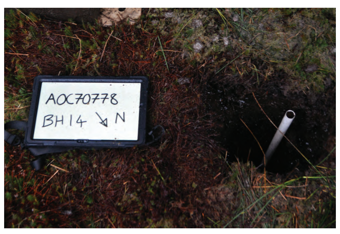
Plate 17: General view of BH14 post-excavation, looking southwest