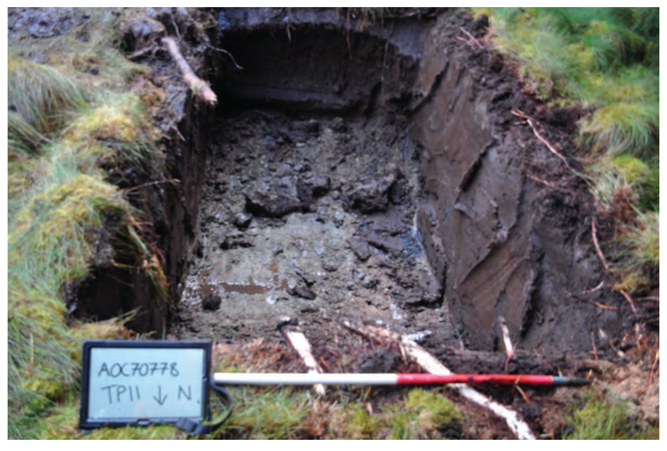
Plate 34: General view of TP11 post-excavation, looking south