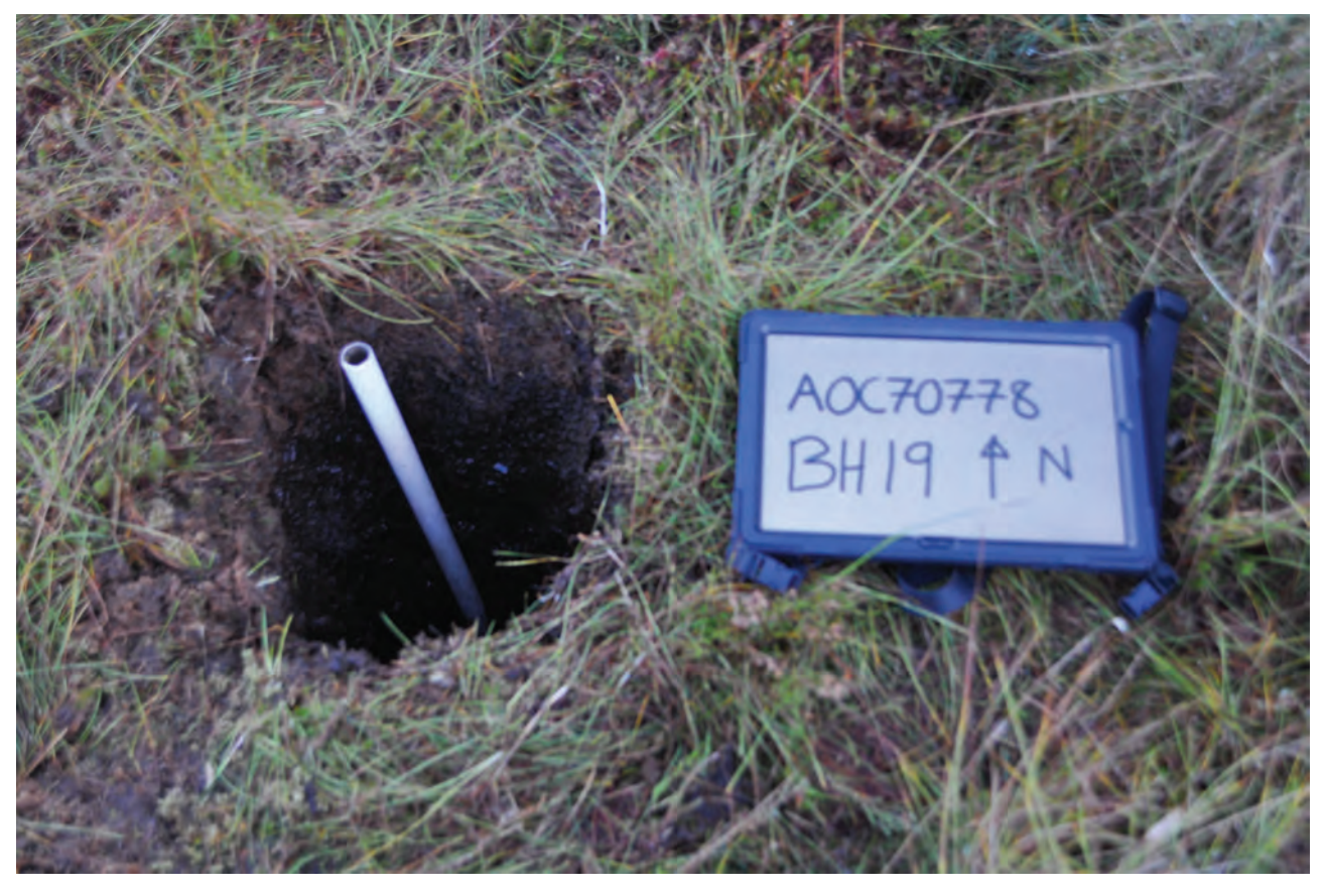
Plate 22: General view of BH19 post-excavation, looking north