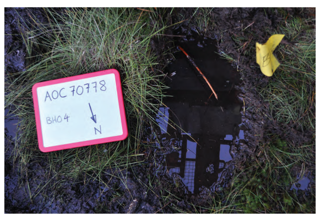
Plate 7: General view of BH04 post-excavation, looking south