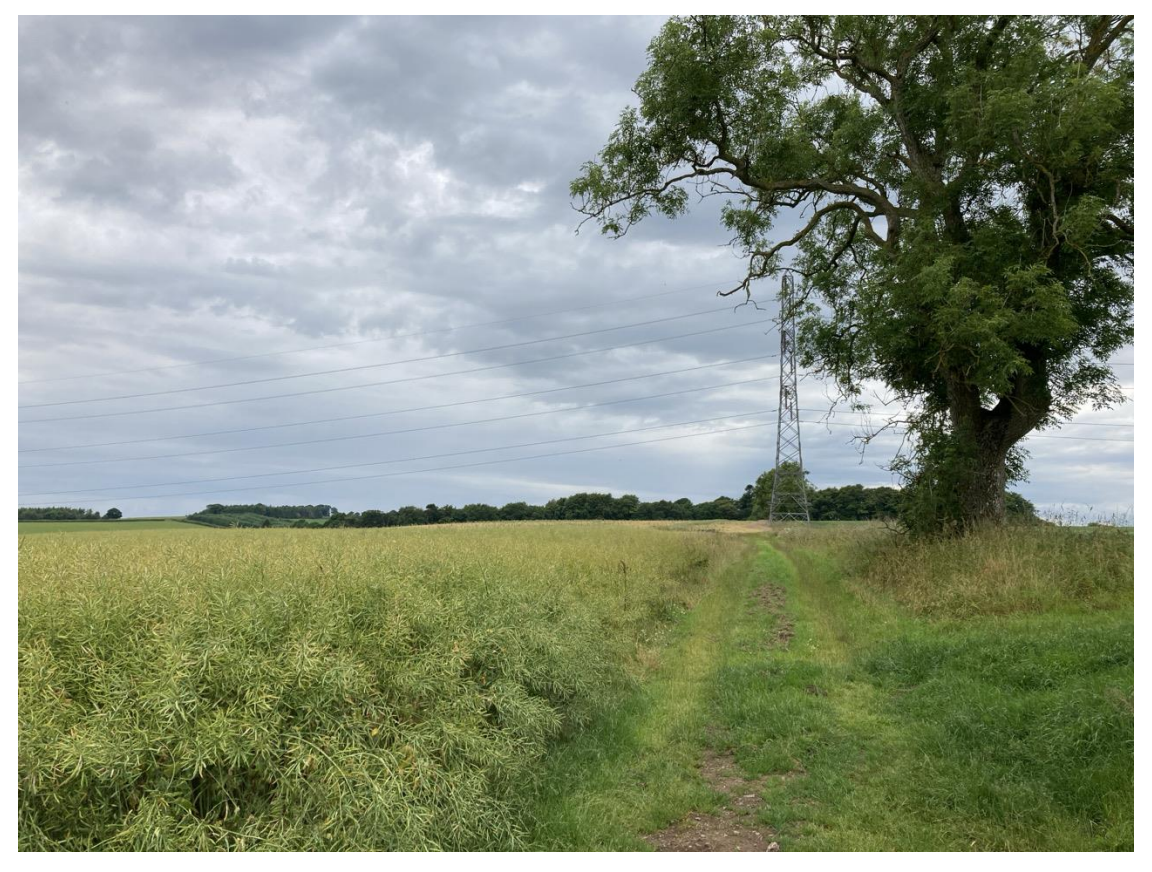
Photograph A11.2-9: View west to Tower 154, an area where access is proposed via 'Trackway Panels'