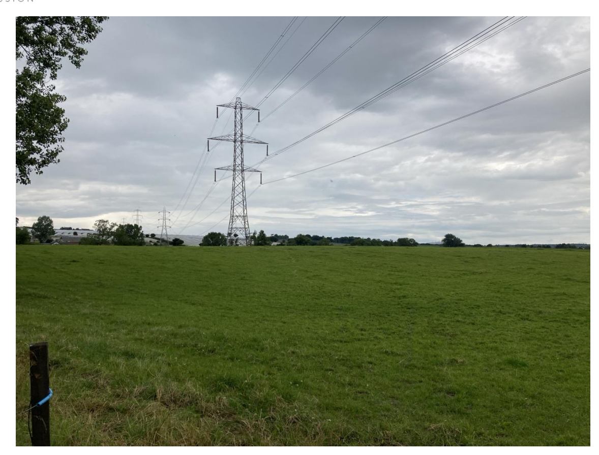
Photograph A11.2-10: View northeast to Tower 144, an area where access is proposed via 'Trackway Panels'. Carmichael Cottages cropmark site (MPK5125) is located in the field show.