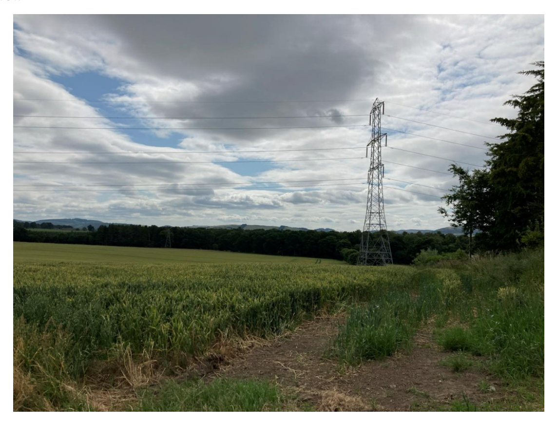
Photograph A11.2-18: View south to Tower 106, an area where access is proposed via 'Trackway Panels'. Ardgaith cropmark site (pits and unenclosed settlement) is also located within the same field (MPK4732).