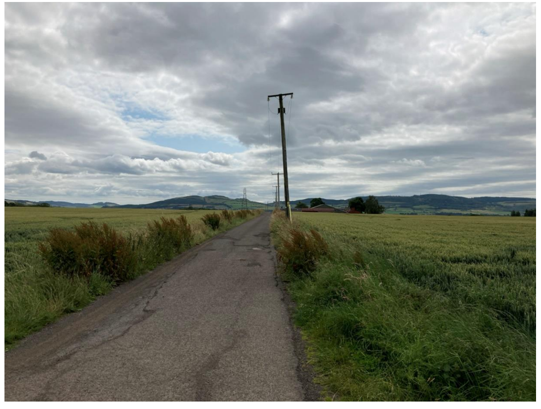
Photograph A11.2-19: View south along existing access proposed for 'Upgrade Exiting Road Track' to provide access to Towers 99 and 100. Gallowflat unenclosed settlement cropmark site located in the field to the left (MPK6792).