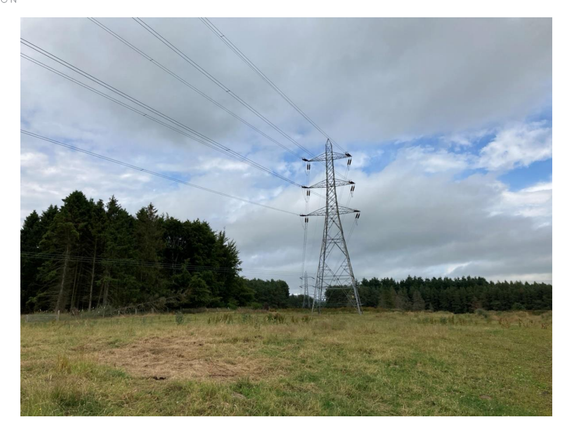
Photograph A11.2-4: View northeast towards Tower 167, an area where access is proposed via 'Upgrade to Existing Road Track'. Dronley House Mound scheduled monument is located in the fenced area on the left side of the image (SM6535).