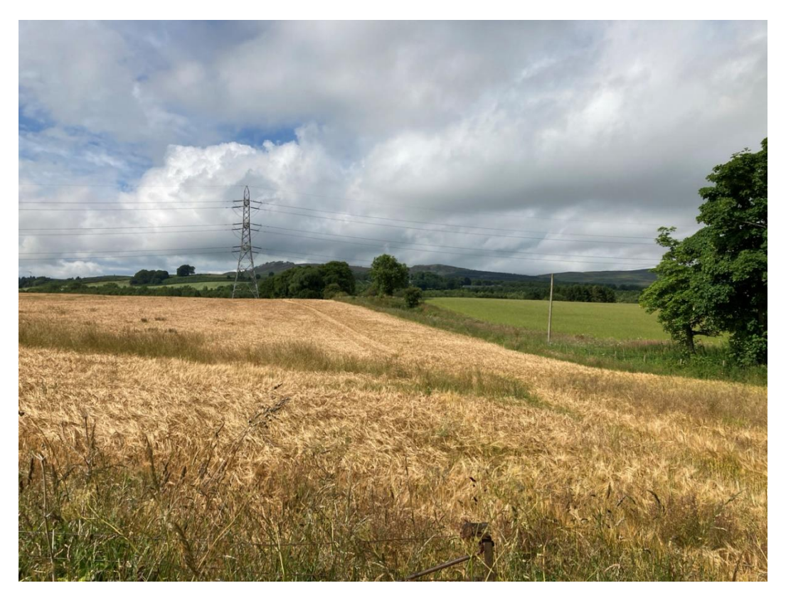
Photograph A11.2-3: View north towards Tower 172, an area where access is proposed via 'Trackway Panels'. The headline to the right marks for former railway line (NO33NW0057), while a scheduled embankment associated with the railway is located in the woods in the distance (SM6123).