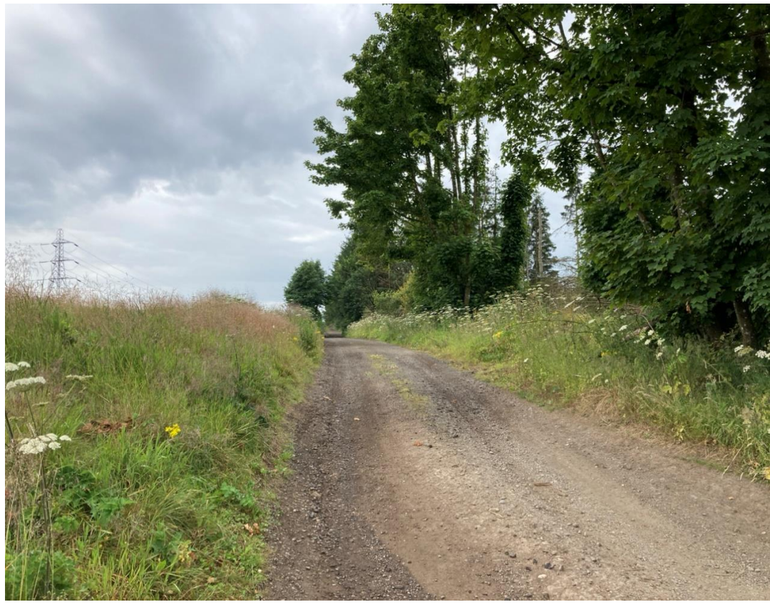
Photograph A11.2-7: View south along existing track at Piperdam Plantation proposed as 'Upgrade to Existing Road Track' on the current design. Track to provide access to Towers Tower 153 to 156, with Tower 156 visible to the left.