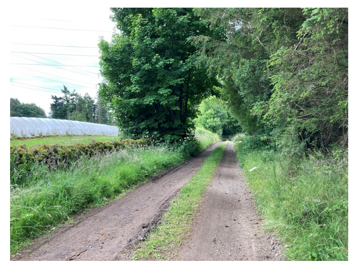
Photograph A11.2-8: View south along existing track at Piperdam Plantation proposed as 'Upgrade to Existing Road Track' on the current design. Track to provide access to Towers Tower 153 to 156.