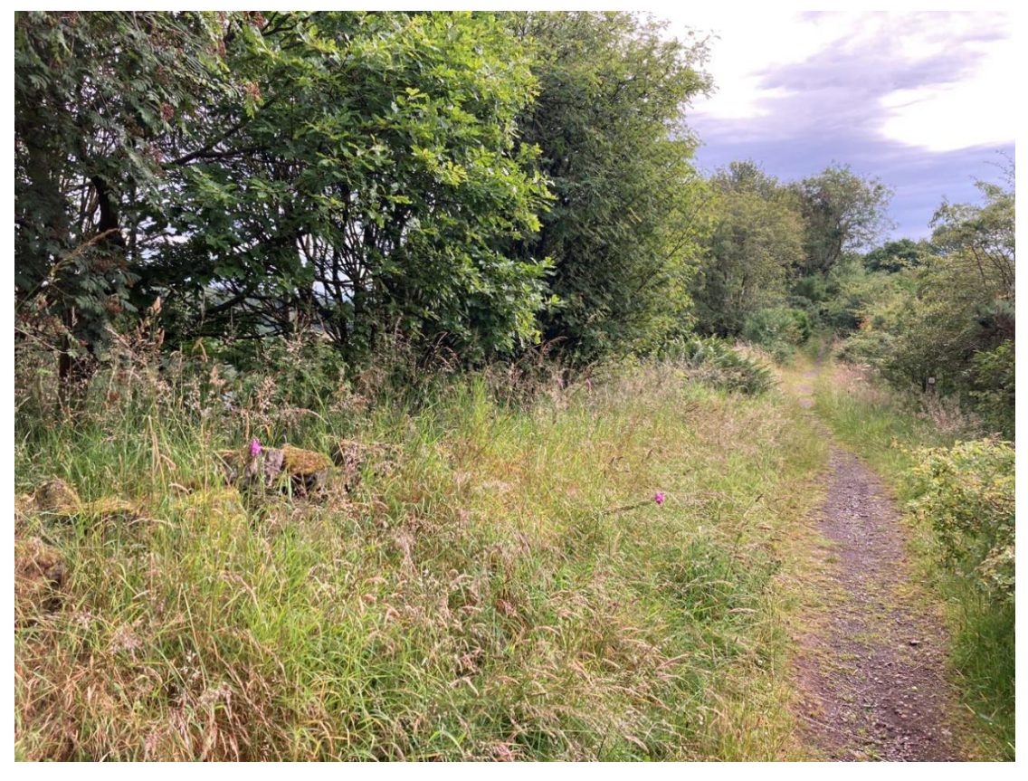
Photograph A11.2-23: View along path where 'New Temporary Stone Road' is proposed to provide access to Towers 66-76 from Woodriffe Road showing fragmentary drystone wall on the north side of the track above Lochmill Loch.