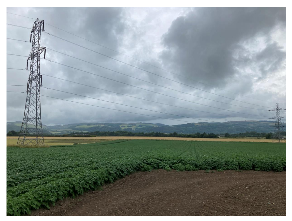
Photograph A11.2-13: View northwest to Towers 118 and 119, an area where access is proposed via 'Trackway Panels'. Photo taken from South Inchmichael unenclosed settlement scheduled monument (SM7199), with the wider area on non-designated cropmarks covering the remainder of the field (MPK5171).