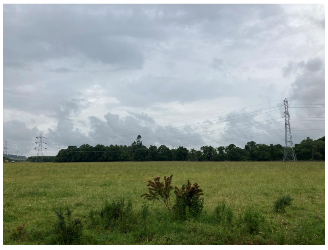
Photograph A11.2-14: View of Megginch Garden and Designed Landscape (GDL) (GDL00278) from the east, with Towers 115 and 116 visible, an area where access is proposed via 'Trackway Panels' within the field.