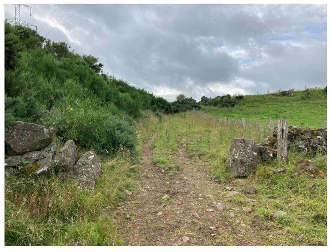
Photograph A11.2-25: View of existing track where a 'Bespoke Track' is proposed to provide access to Tower 66 showing existing break in drystone wall on the northwest side of Colzie Hill.