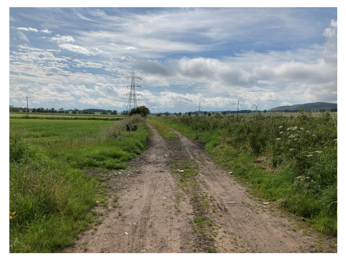
Photograph A11.2-1: View west towards Tower 182 showing the existing track where a proposed 'New Temporary Stone Road' forms part of the current design.