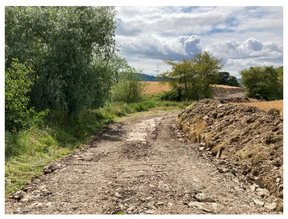
Photograph A11.2-21: View southwest along area noted as 'New Temporary Stone Road' in area of cropmark site (MPK6807).