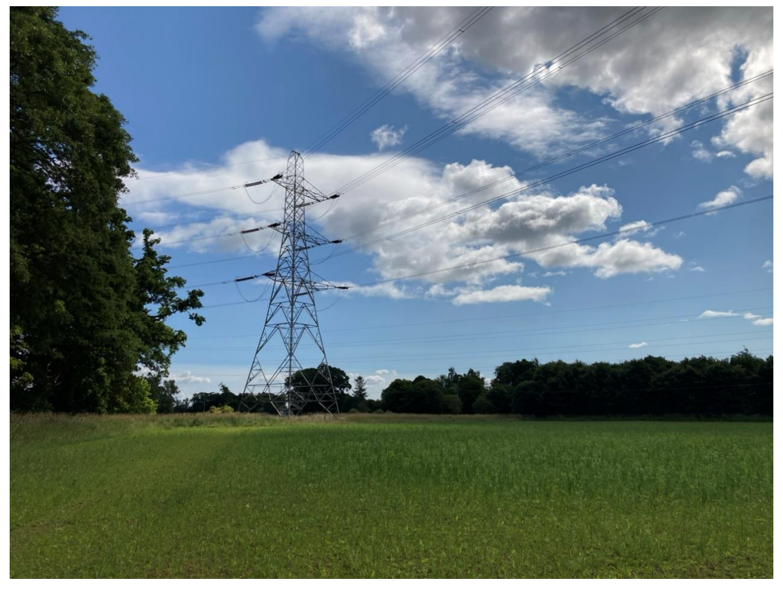
Photograph A11.2-16: View of Tower 115 from the west with woodland that forms part of Megginch GDL (GDL00278) will be subject to crown reduction and limited tree loss (inline with the OHL resilience works).