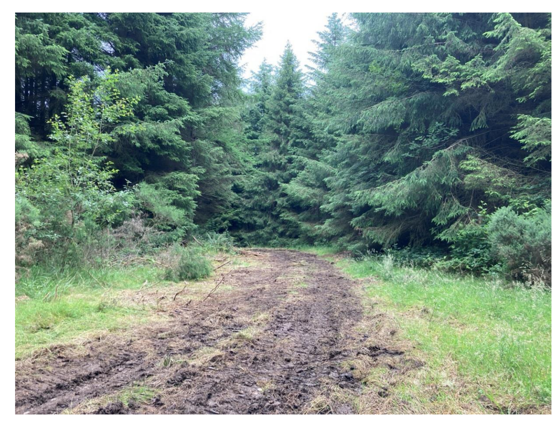
Photograph A11.2-26: General view of tracks in Pitmedden Wood where 'New Temporary Stone Road' is proposed to gain access to Towers 66-68.