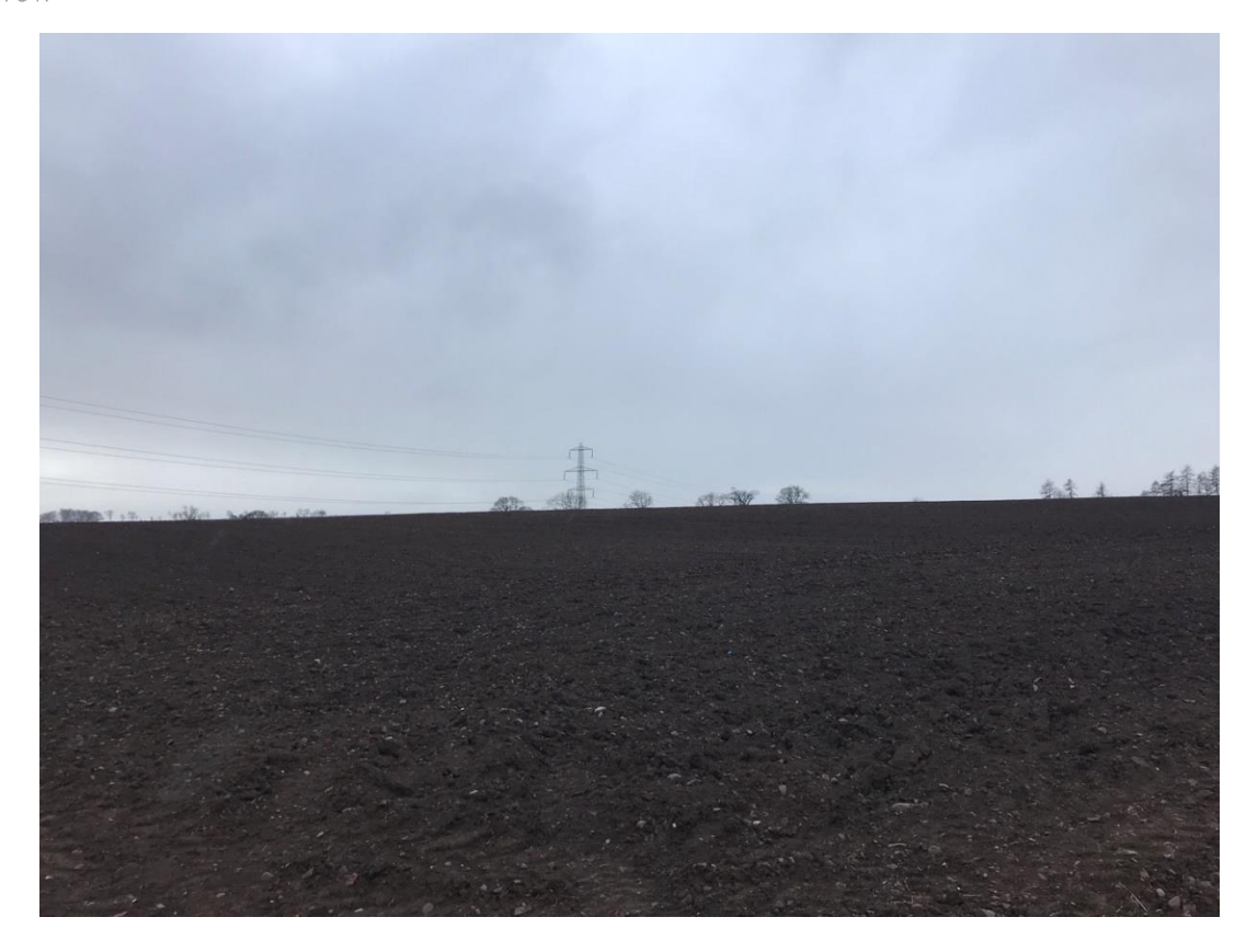
Photograph A11.2-6: View south towards Tower 164, an area where access is proposed via 'Trackway Panels'. The scheduled East Adamson souterrain and unenclosed settlement is located beyond Tower 164.