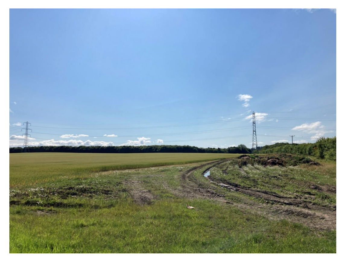
Photograph A11.2-17: View south to Tower 112 where access is proposed via 'Trackway Panels'. Hedgerow to the right forms the western limit of Megginch GDL (GDL00278). Cropmark site has been recorded in the area of Tower 112 (MPK4722).