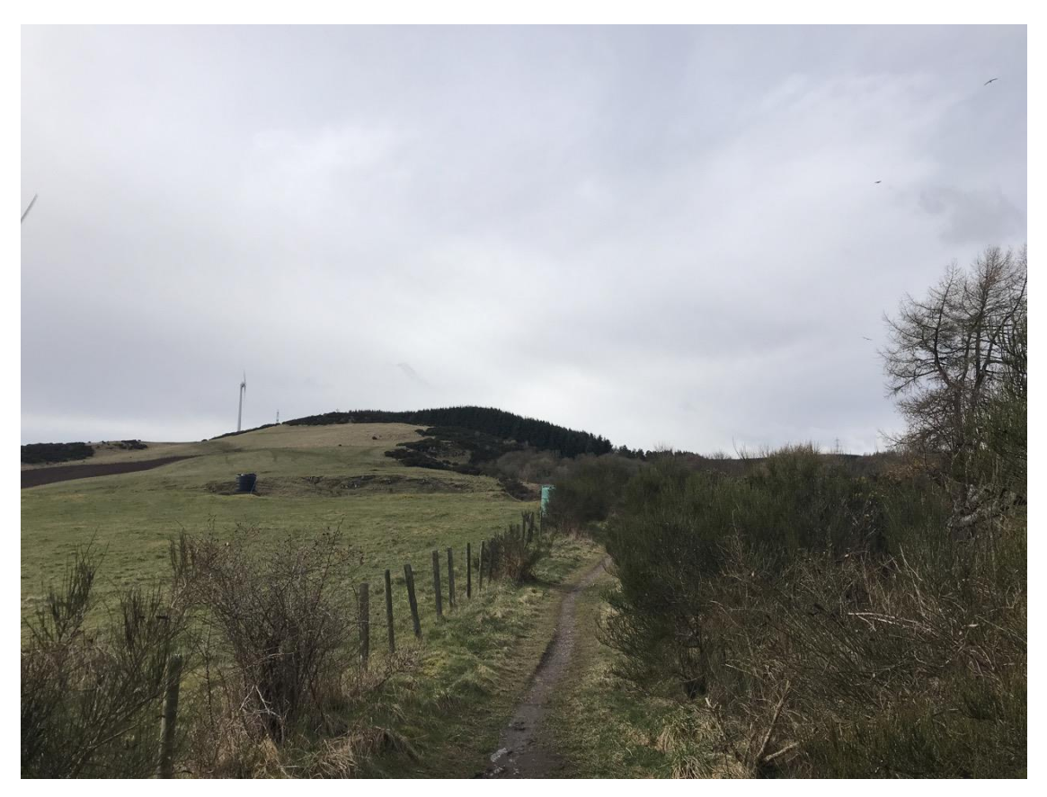
Photograph A11.2-22: View west along path where 'New Temporary Stone Road' is proposed to provide access to Towers 66-76 from Woodriffe Road.