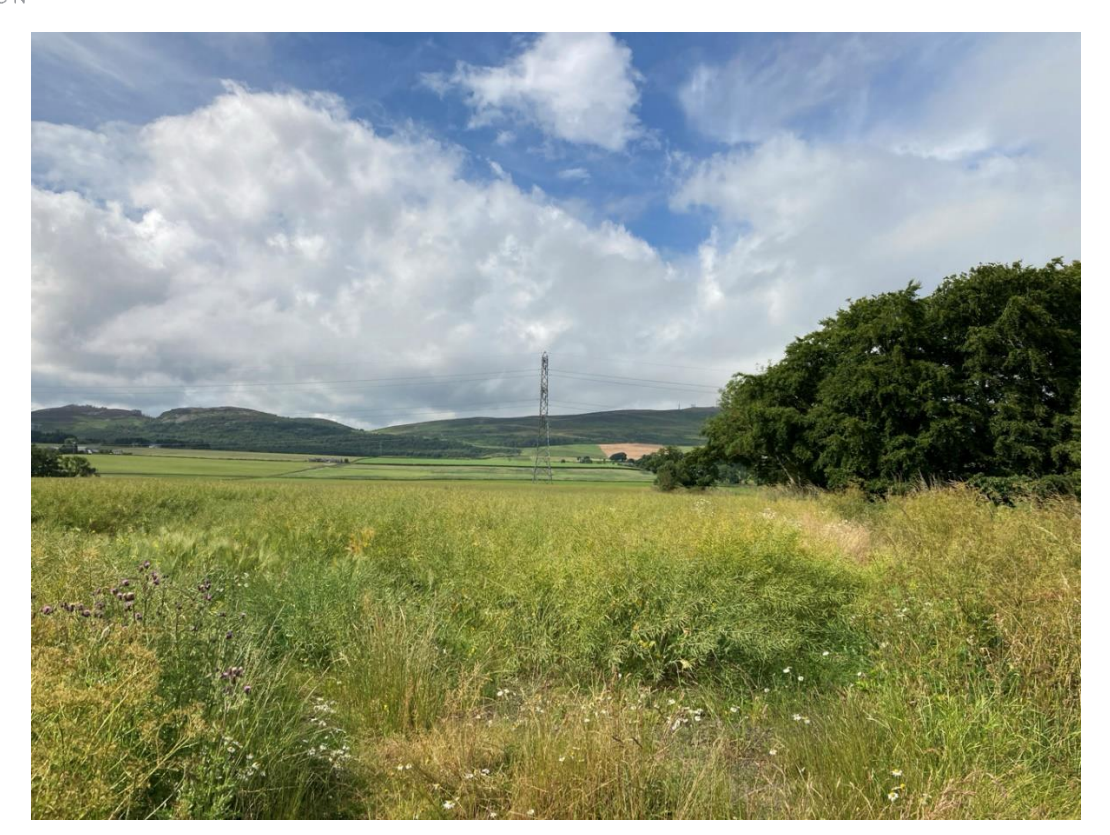
Photograph A11.2-2: View north to Tower 177, an area where access is proposed via 'Trackway Panels' in area of cropmarks (NO33NE0033).