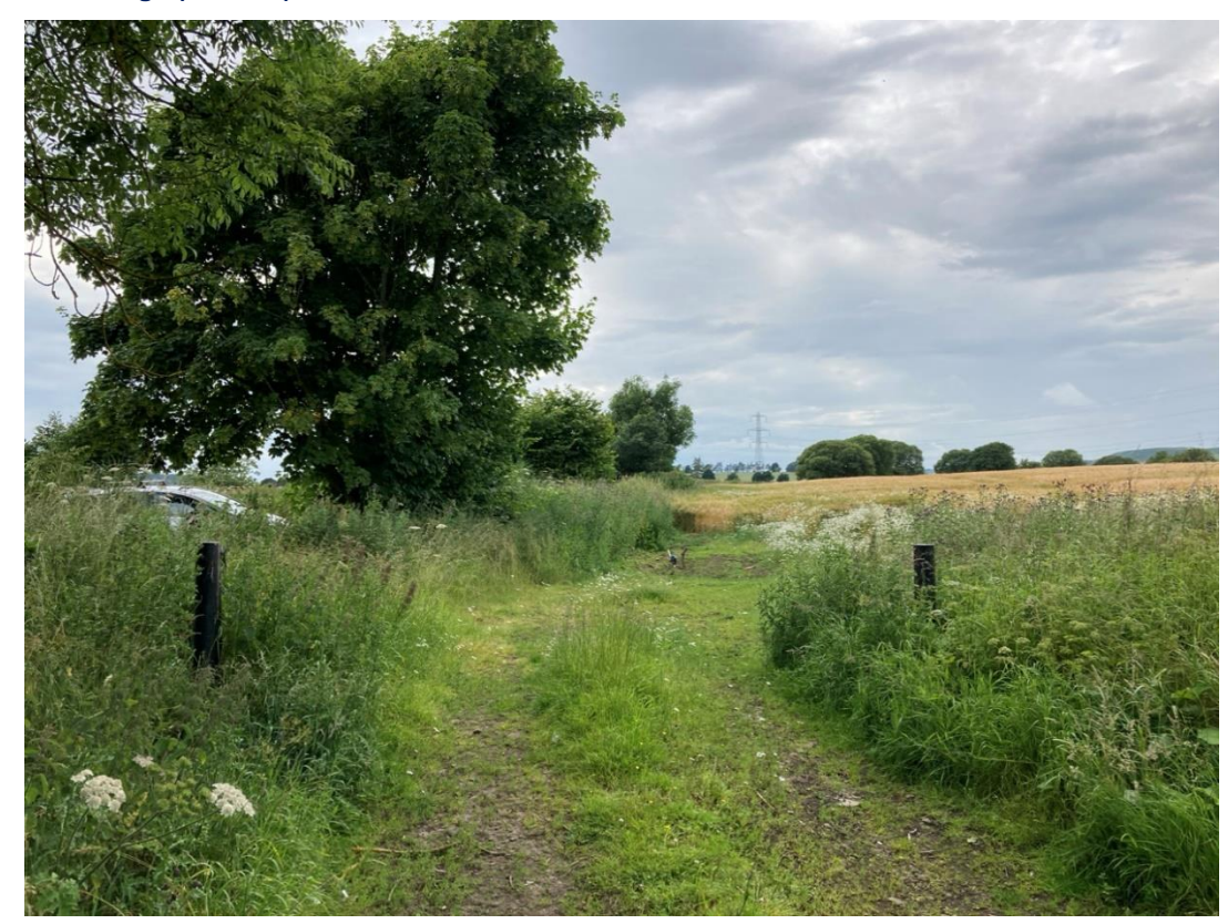
Photograph A11.2-5: View towards Tower 166, where access is proposed via 'Trackway Panels'. The hedgerow to the left marks the alignment of the former Dundee to Newtyle Railway (NO33NW0052), and the trackway panels on the current design follow the field side of the hedgerow.