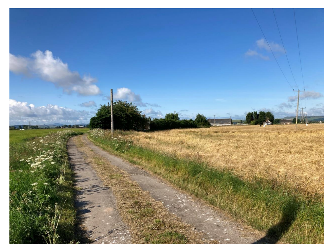
Photograph A11.2-12: View west to West Mains of Castle Huntley, an area where access is proposed via 'Upgrade to Existing Road Track'.