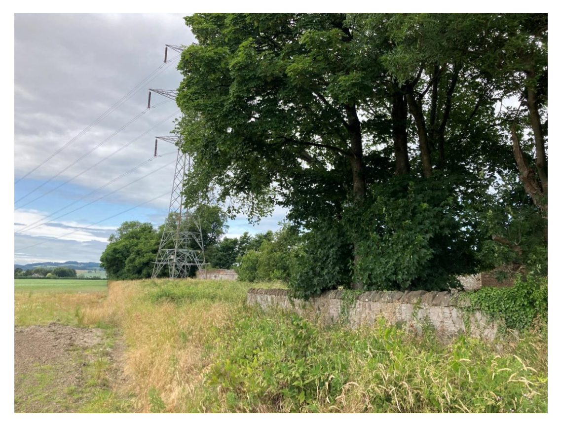
Photograph A11.2-20: View west to Tower 97, an area where access is proposed via 'Trackway Panels'. Pitfour Walled Garden (MPK18871) located to the right of the image.