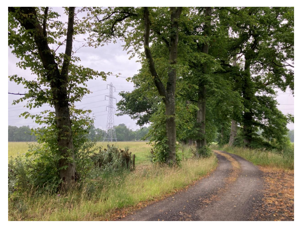
Photograph A11.2-15: View of west along the Eastern Avenue of Megginch GDL (GDL00278), with Tower 115 visible, an area where access is proposed via 'Upgrade to Existing Road Track'.