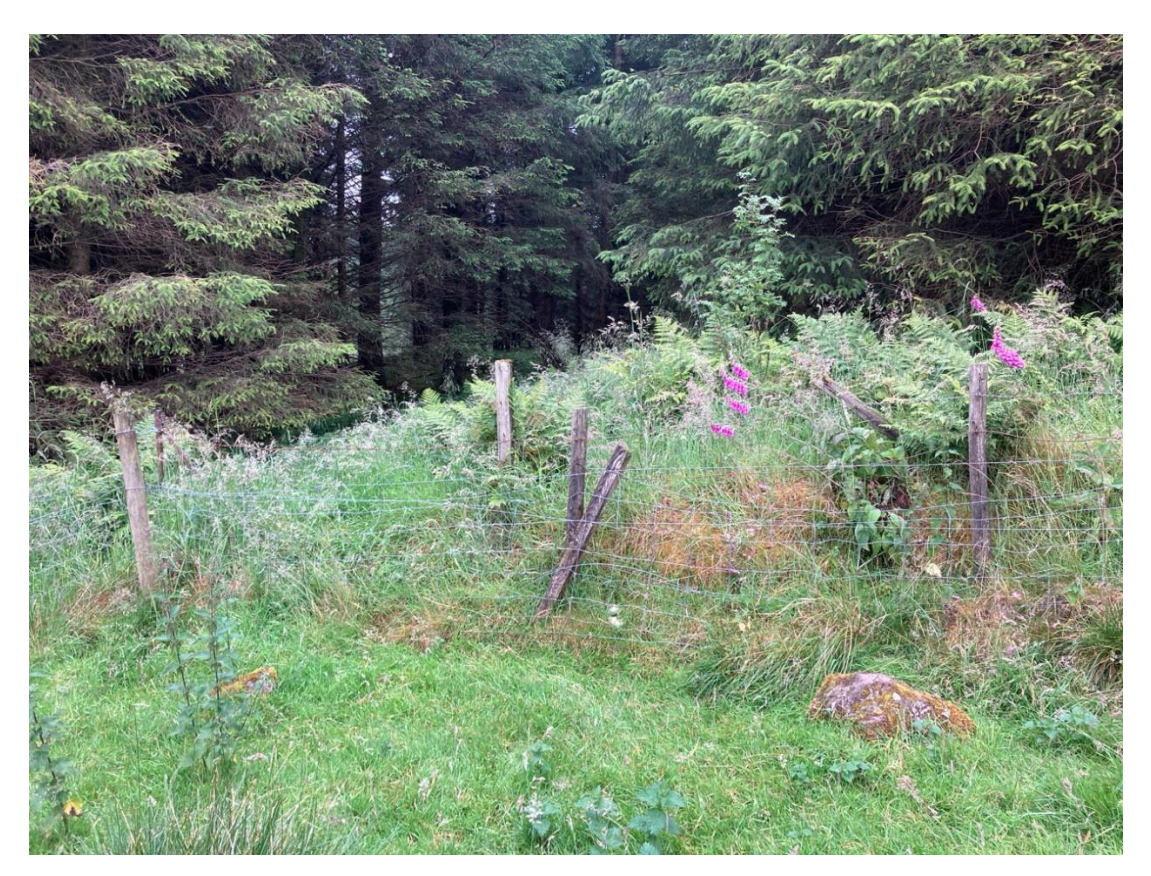
Photograph A11.2-24: View of area where 'New Temporary Stone Road' is proposed to provide access to Tower 69 showing fragmentary drystone wall on eastern edge of woodland.